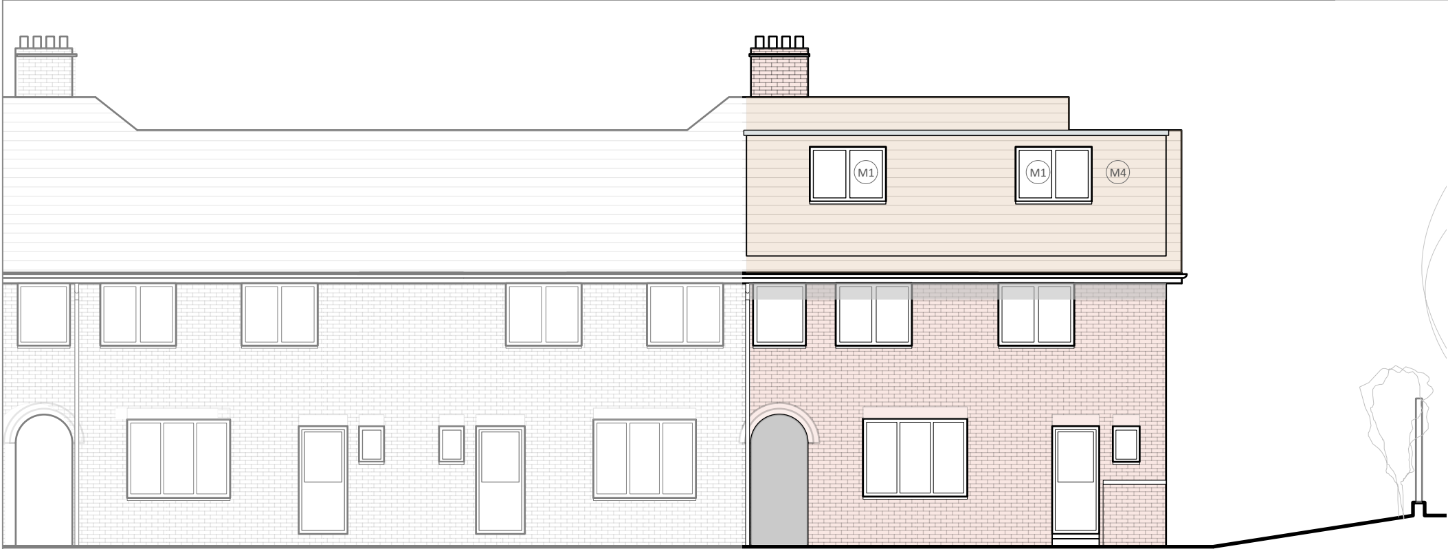
ELEVATION to rear gardens