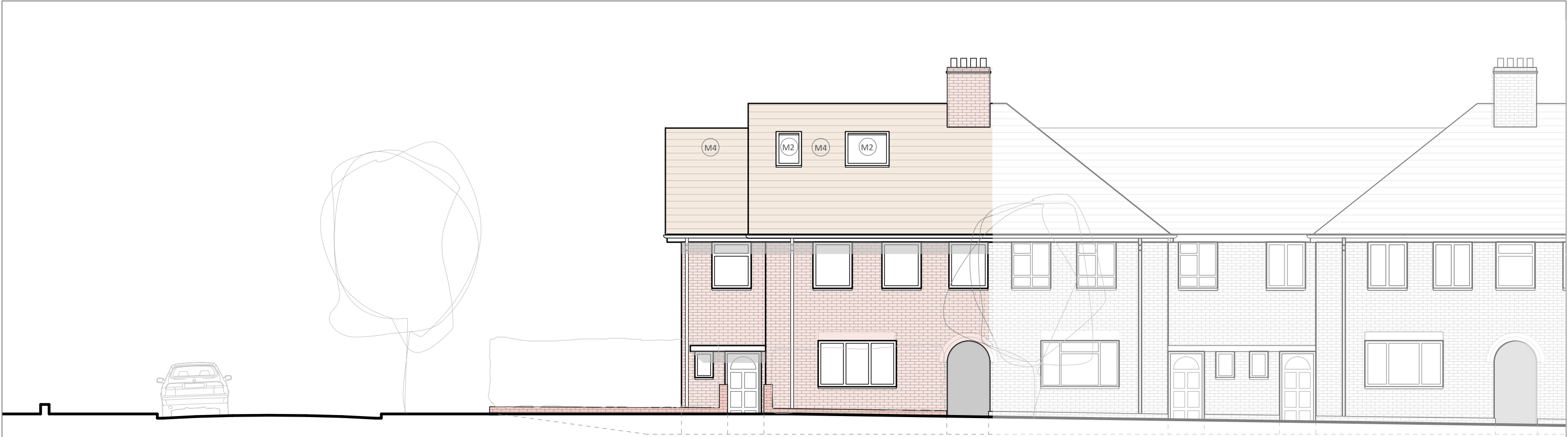
ELEVATION to Crossthwaite Avenue