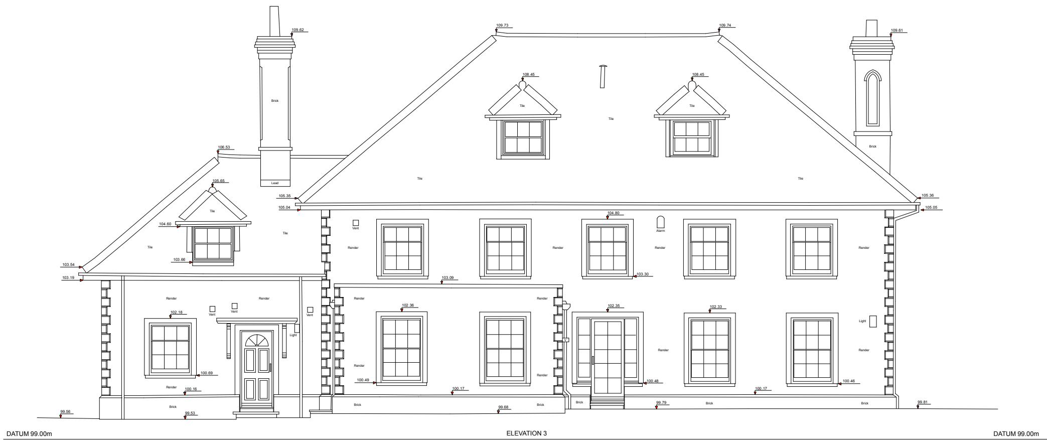
01 existing north-east [rear] elevation Scale: 1:100