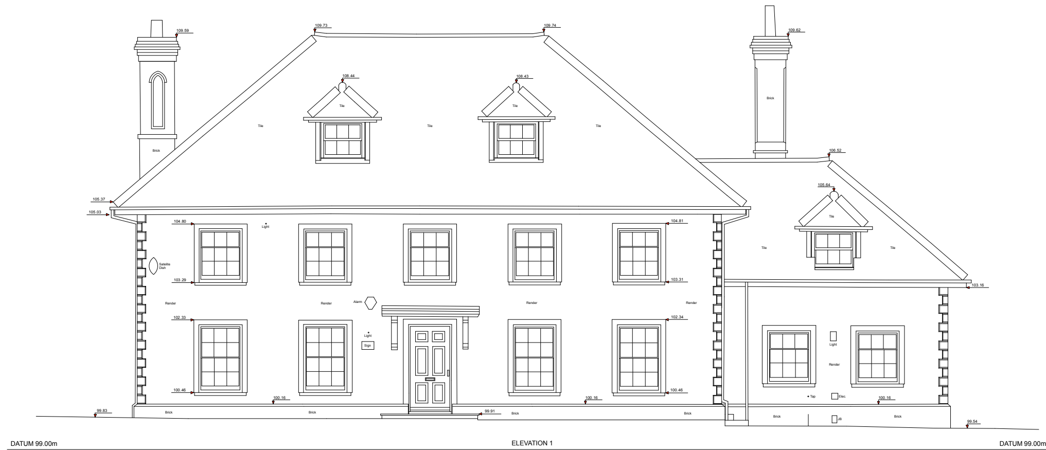
01 proposed south-west [front] elevation [no perceived change] Scale: 1:100