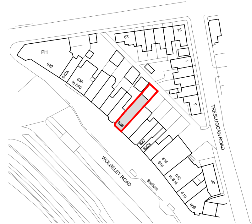
Site Location Plan Scale 1:1250