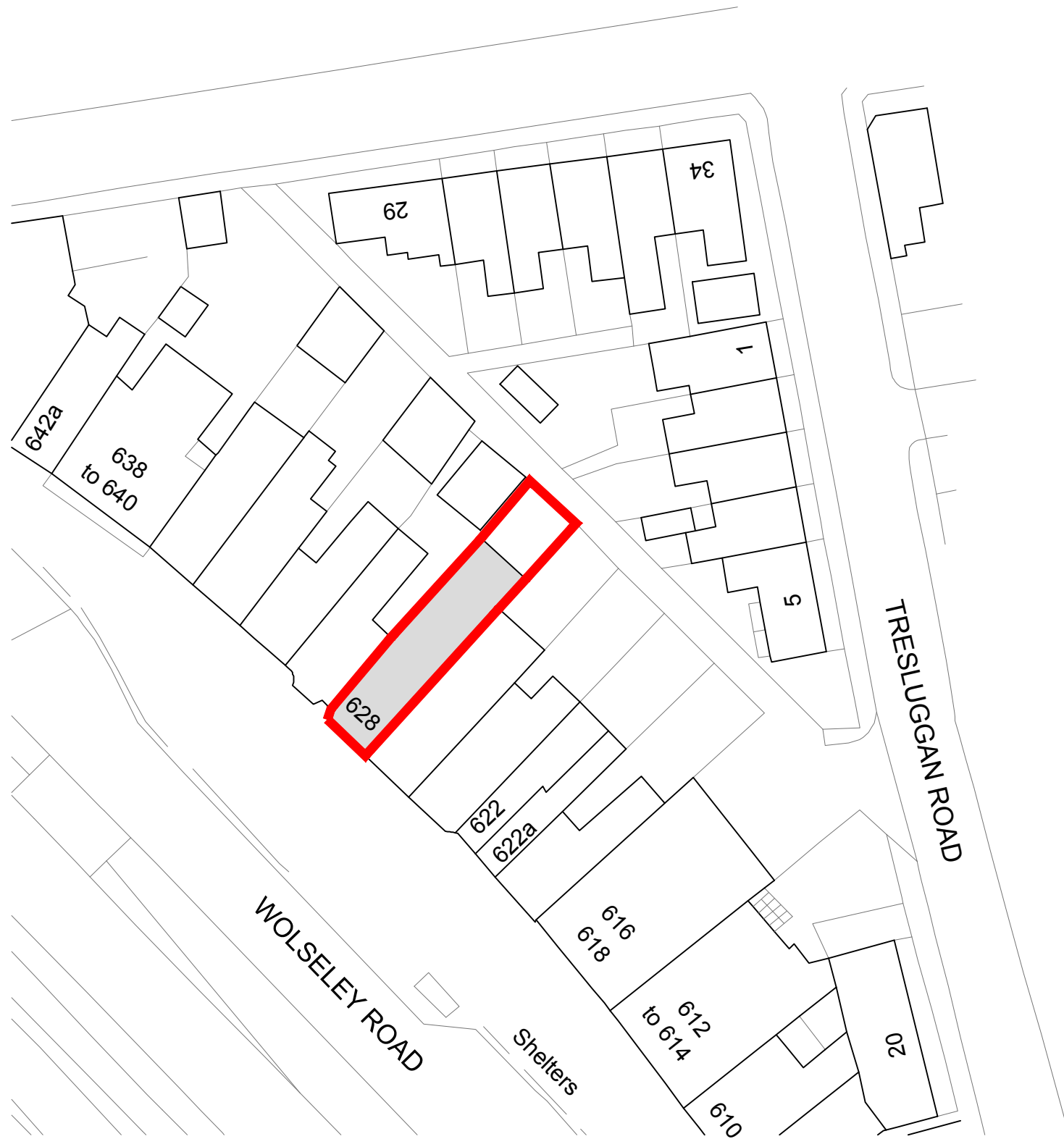
Site Block Plan Scale 1:500