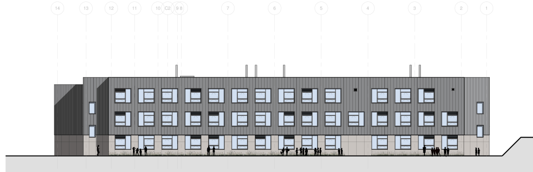
1 North Elevation 1 : 200

FOR ELECTRONIC DATA ISSUE Electronic Data drawings are issued as "read only" and should not be interrogated for measurement. All dimensions and levels should read, only from those values stated in text on the drawing.