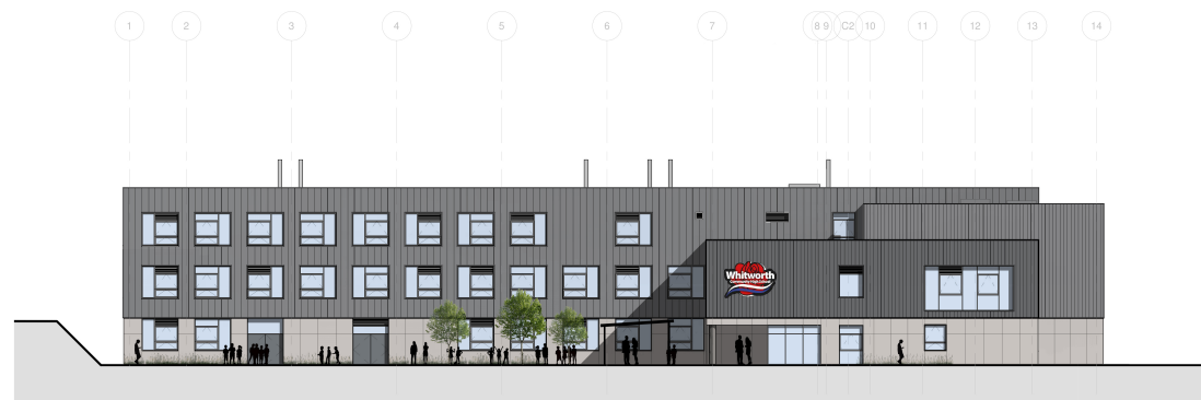
2a South Elevation 1 : 200