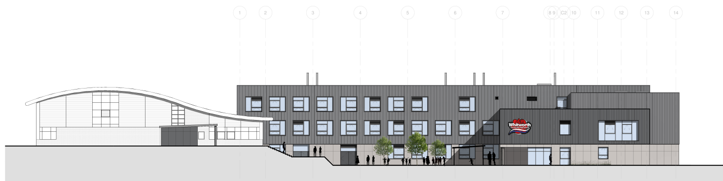
2b South Elevation with Sports Hall 1 : 200