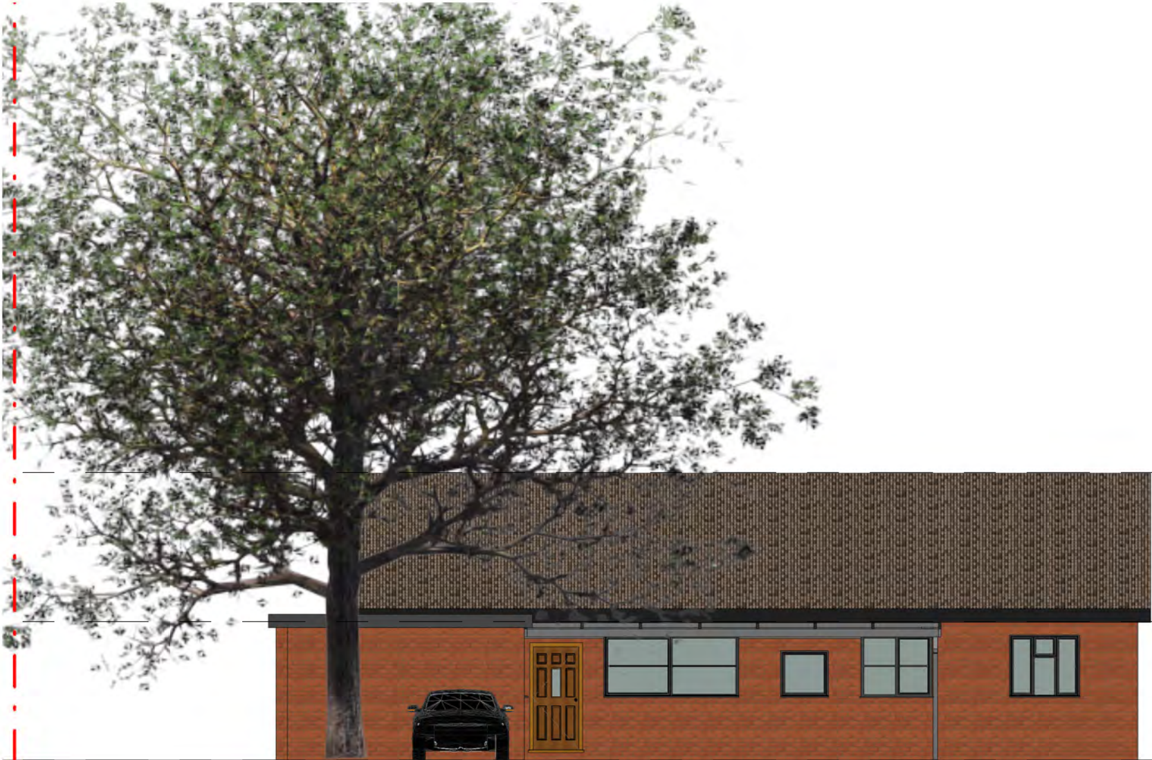
1 Extg. Front 1 : 100

02 - Eaves 5500 01 - First Floor 2650 00 - Ground Floor 0