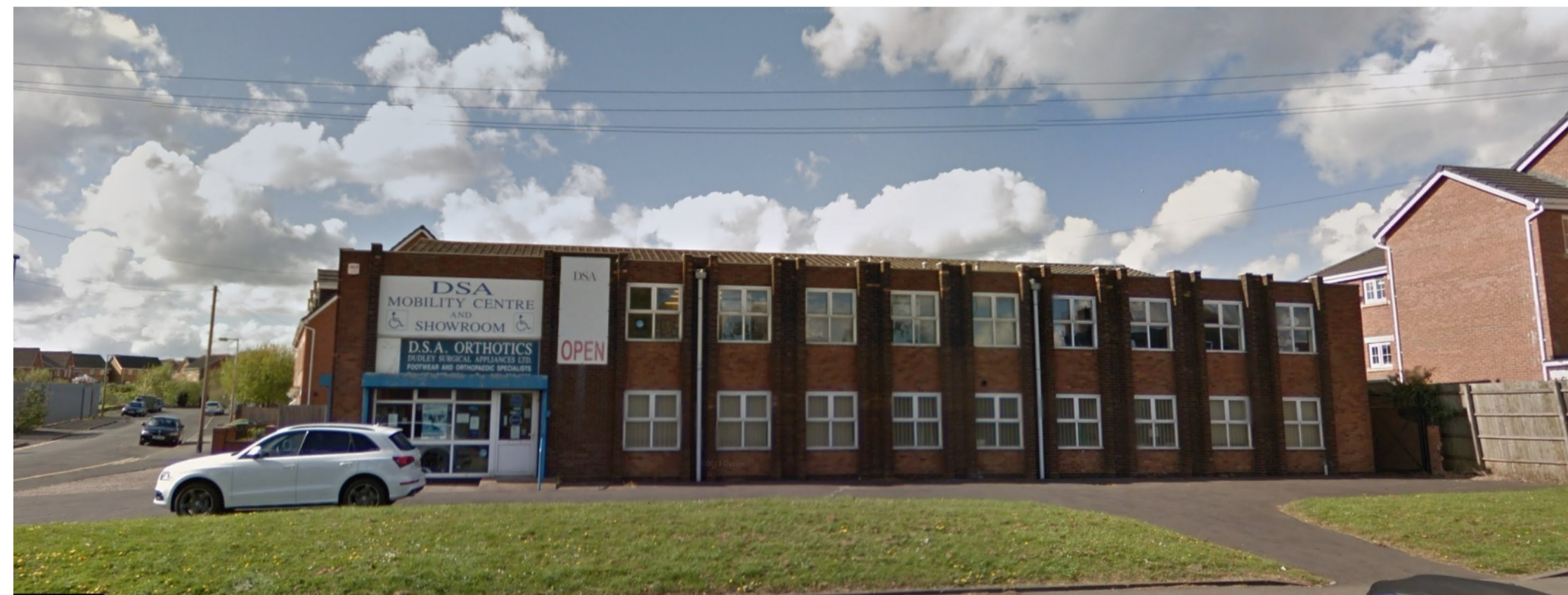
○ View from HORSELEY HEATH

THE INFORMATION CONTAINED IN THIS DRAWING IS THE SOLE PROPERTY OF HMO A.M. ANY REPRODUCTION OR USE IN PART OR AS A WHOLE WITHOUT THE WRITTEN PERMISSION OF HMO A.M. IS PROHIBITED.