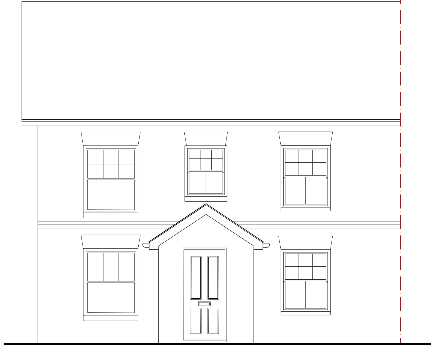
2 Proposed South Elevation 1 : 50