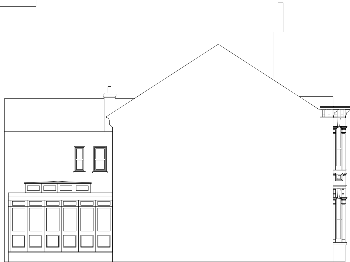
2 South Elevation Scale: 1:100