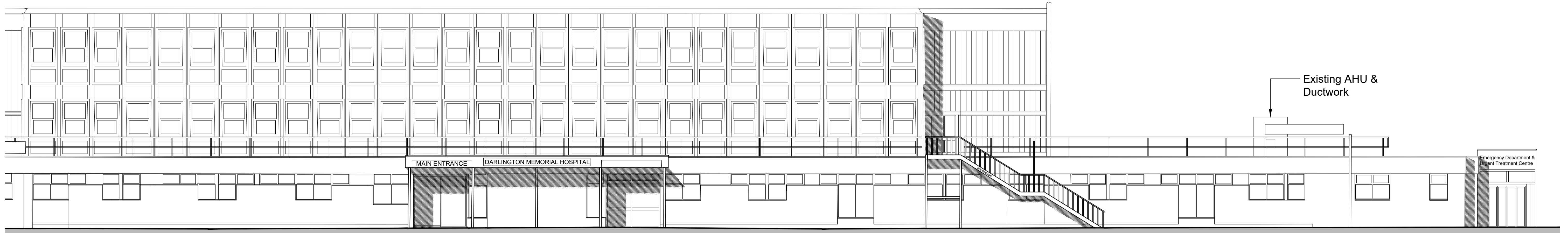
Existing North West Elevation Scale 1:100

*For the purposes of Planning Consent the following applies to any copy of this drawing made by the Local Authority: This copy has been made by and with the authority of the person required to make the plan and drawing open to public inspection pursuant to Section 47 of the Copyright, Designs and Patents Act 1988. Unless that Act provides a relevant exception to copyright, the copy must not be copied without the prior permission of the copyright owner. If any copy is made under the authority only the whole drawing including the copyright holder's name and this notice, is to be copied.*