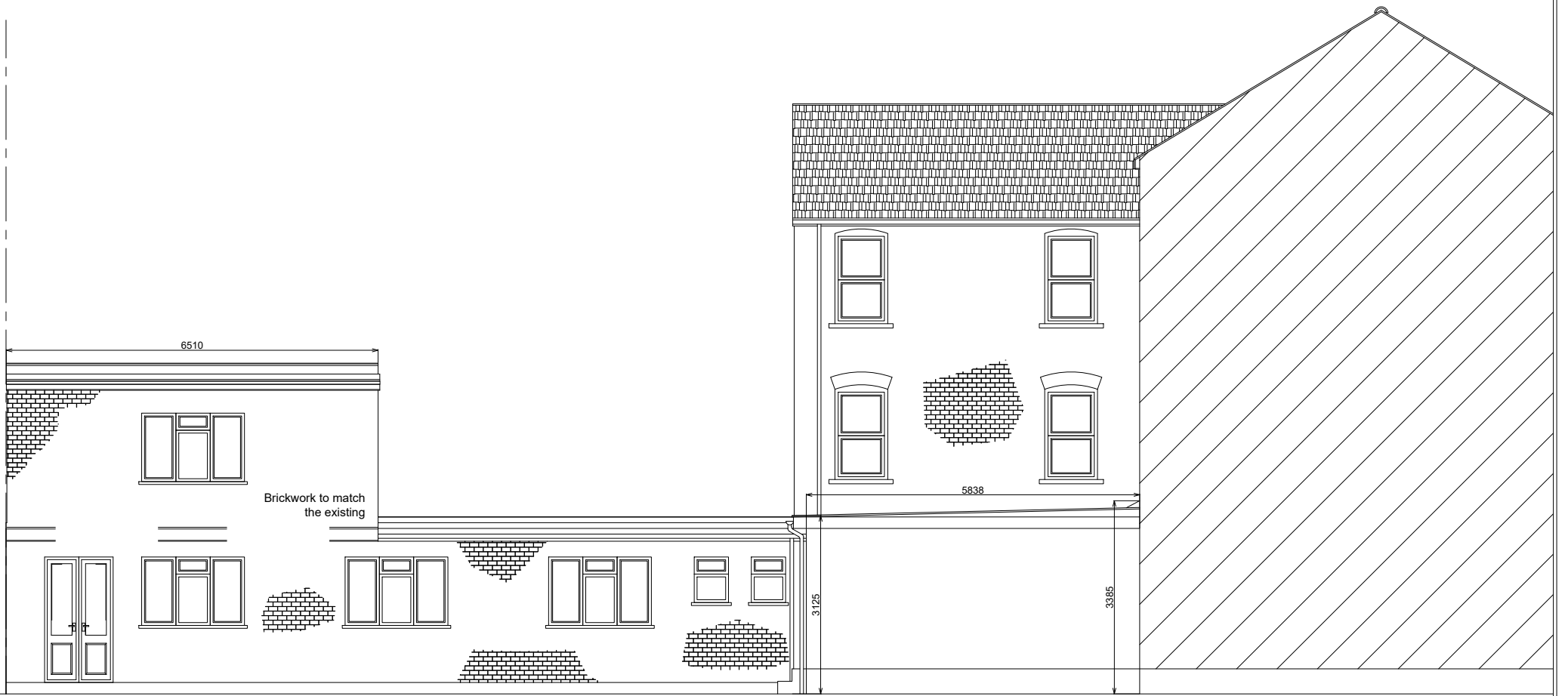
PROPOSED (No:290 ) SIDE ELEVATION