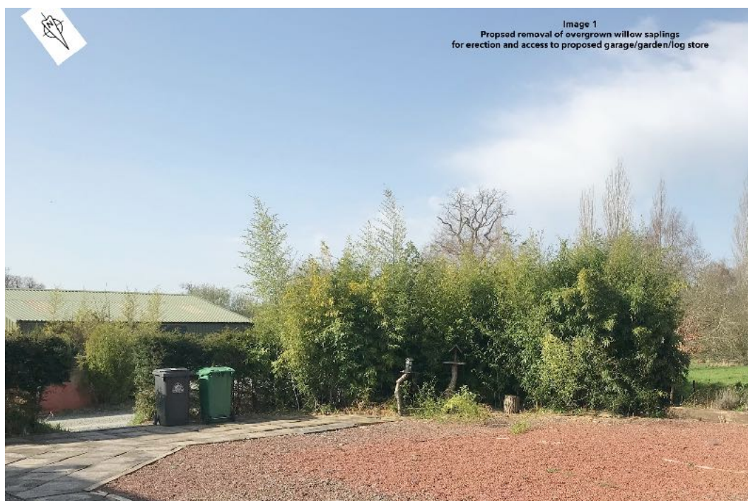
View from existing dwelling to proposed site