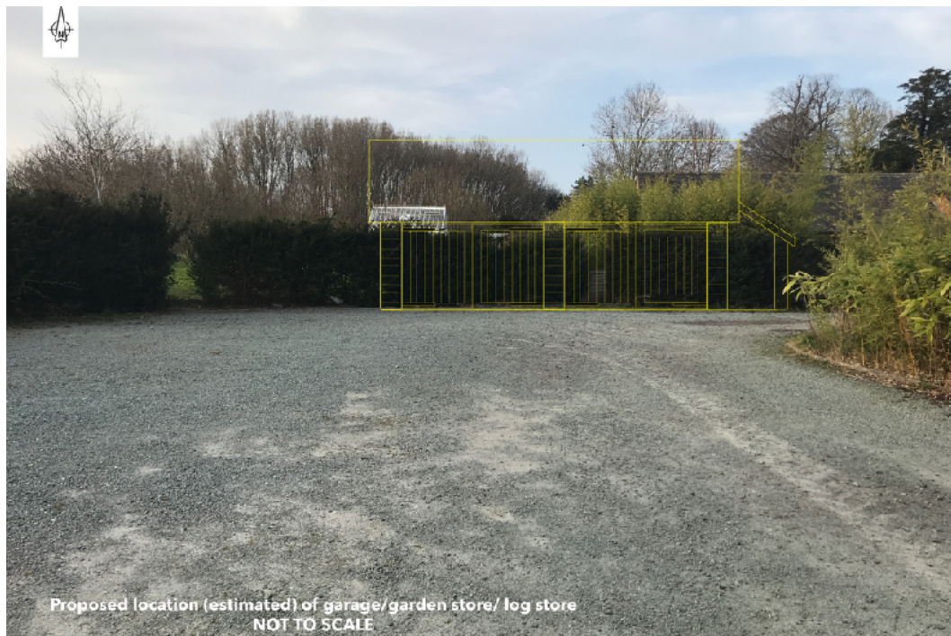
View from existing Driveway (NOT TO SCALE)

The height has been limited to the specifications of Permitted Development guidelines, the height of the eaves being 2m and the height of the ridge is 4m.