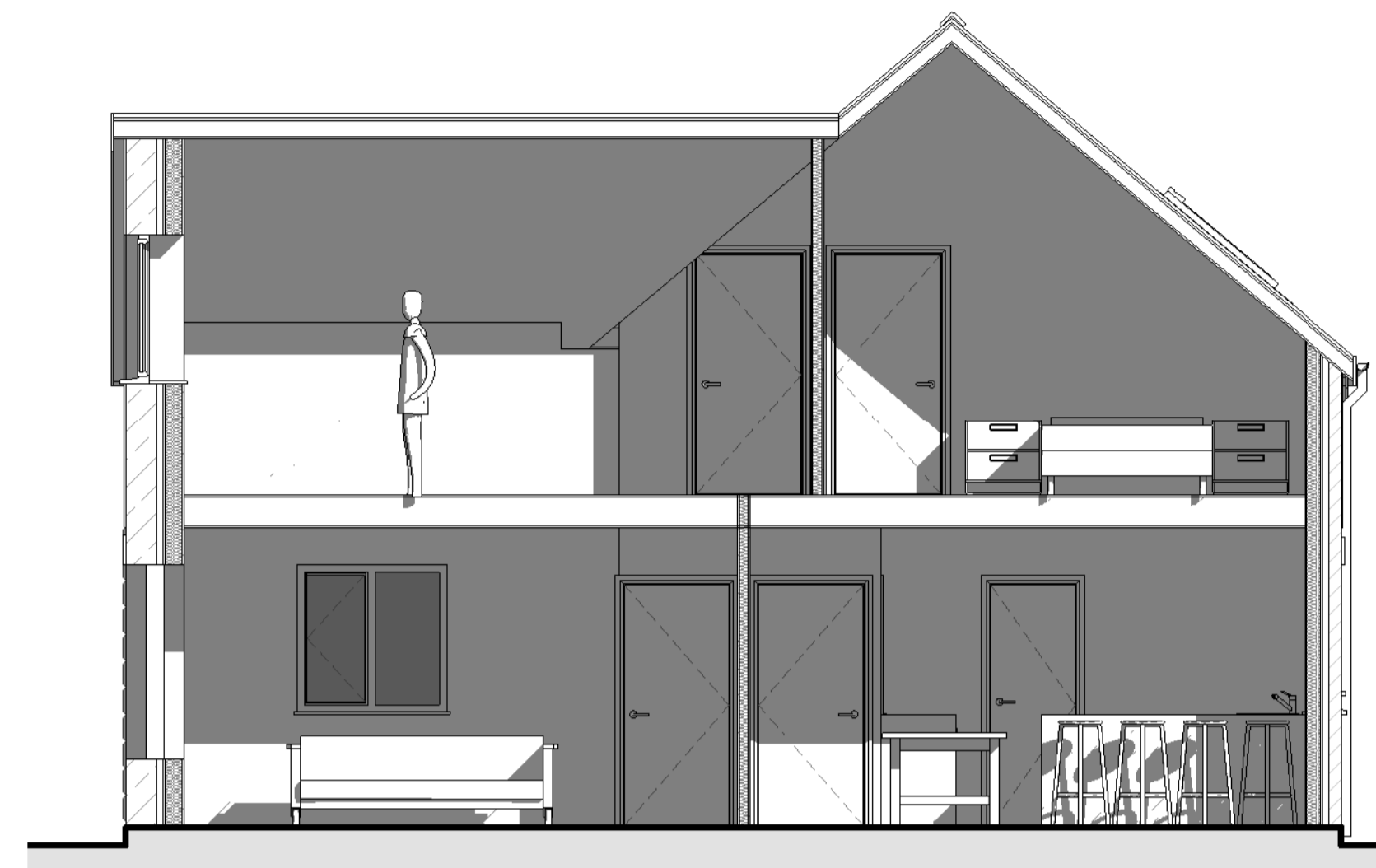
3 Section A-A 1 : 50