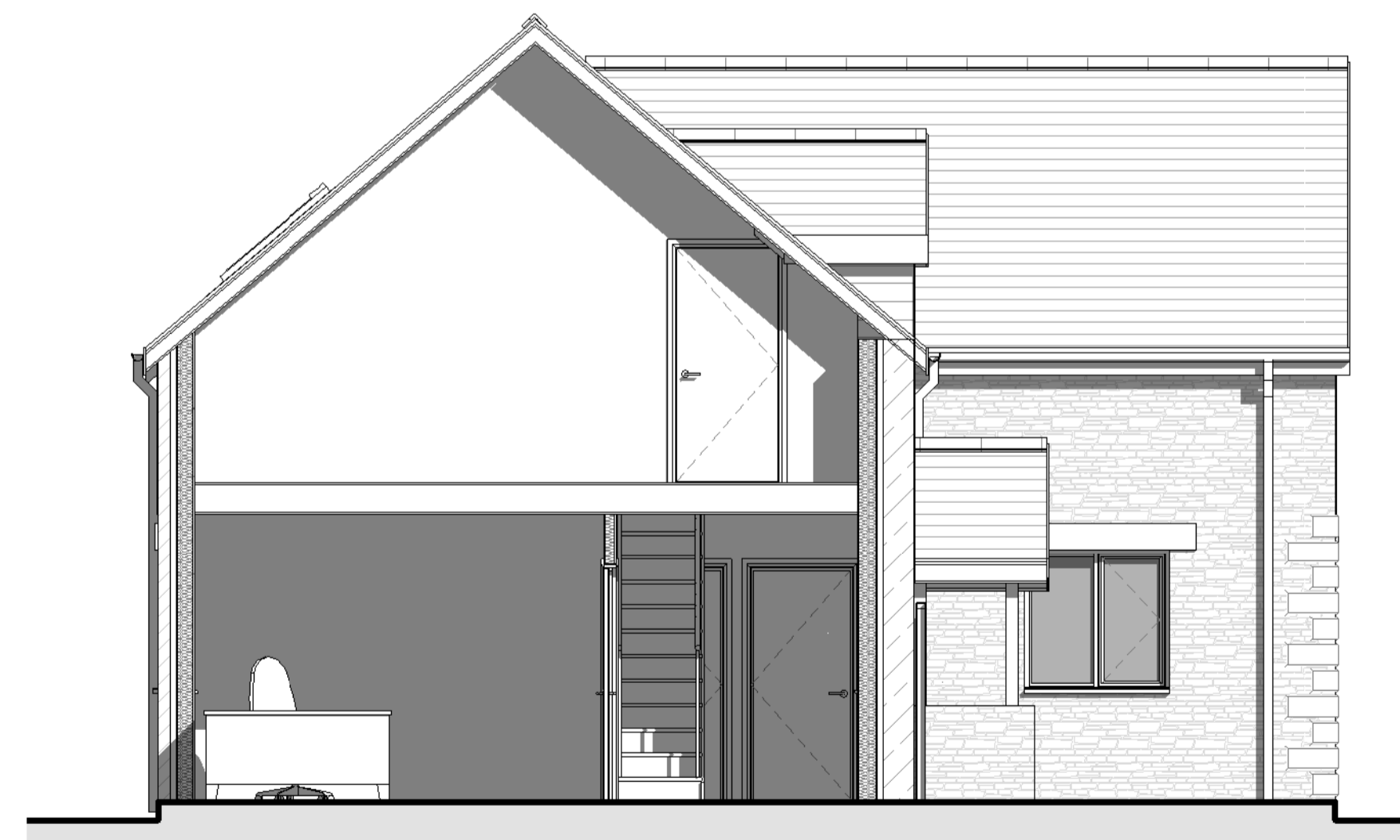
4 Section B-B 1 : 50