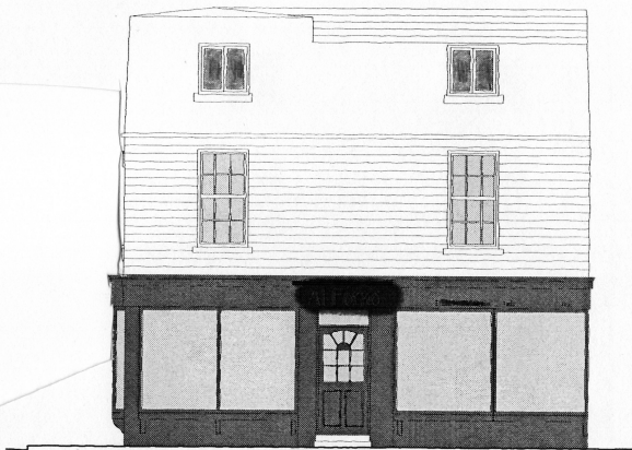
Existing Front Elevation (North)