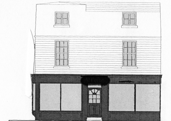
Pre-existing Front Elevation (North)