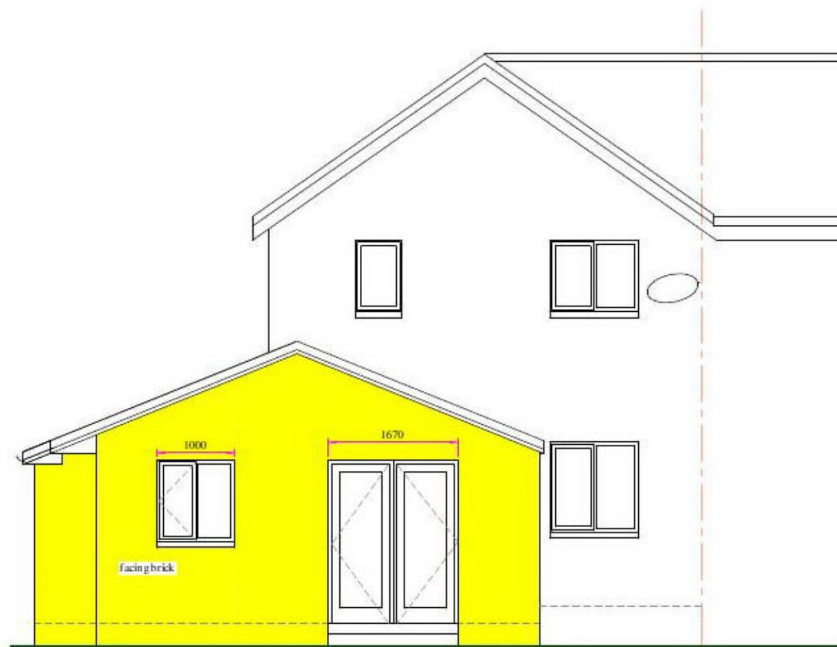
PROPOSED REAR VIEW