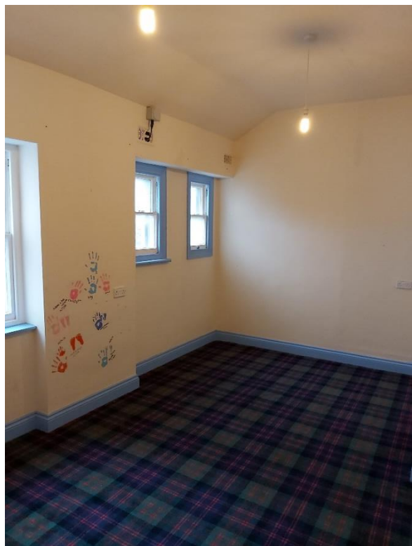
Room 2 before