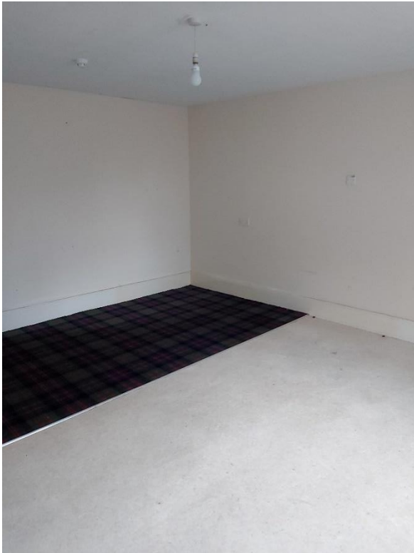
Room 1 before