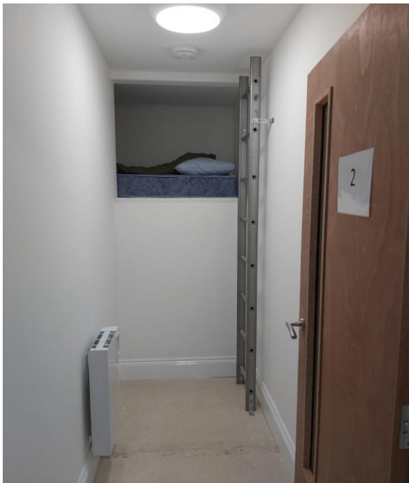
Room 1 (pod 2) after