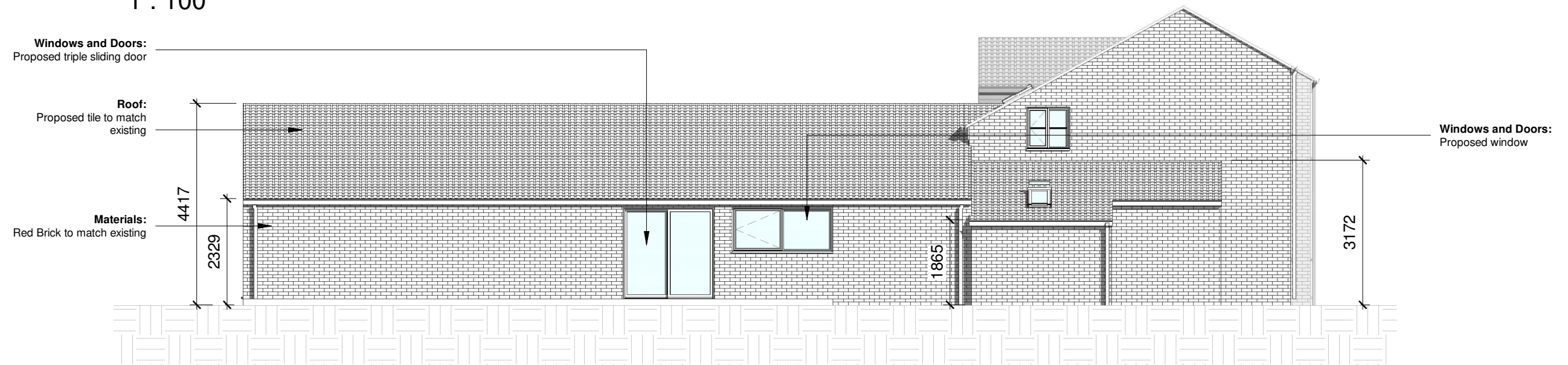
West 1 : 100

Do not scale from drawing. AM2 Ltd accept no responsibility for any dimensions obtained by measuring or scaling from this drawing and no reliance should be placed on such dimensions. If no dimension is given, it is the responsibility of the recipient to obtain the dimension specifically from the author or by site measurement. The sizing of all structural and service elements must always be checked against the relevant engineer's drawings. No reliance should be placed upon sizing information shown on this drawing.