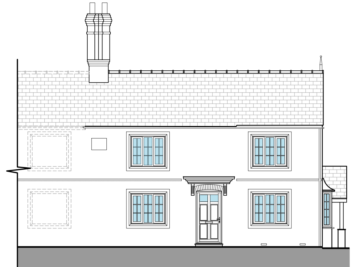
West Elevation 1:100