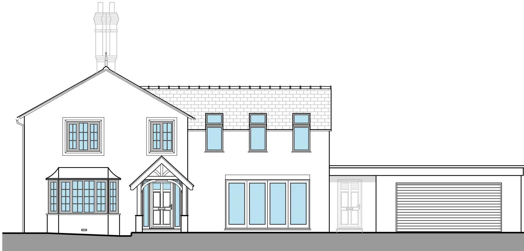
South Elevation 1:100