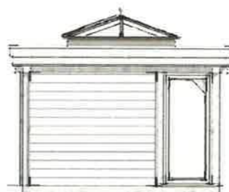
PROPOSED NORTHERN ELEVATION