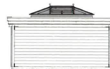
PROPOSED EASTERN ELEVATION