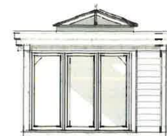
PROPOSED SOUTHERN ELEVATION