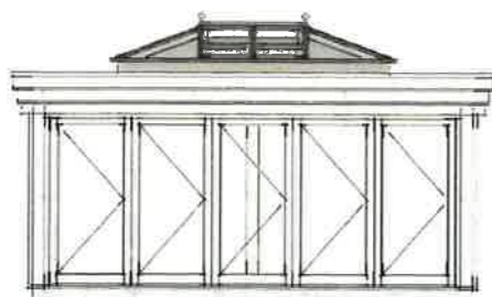
PROPOSED WESTERN ELEVATION