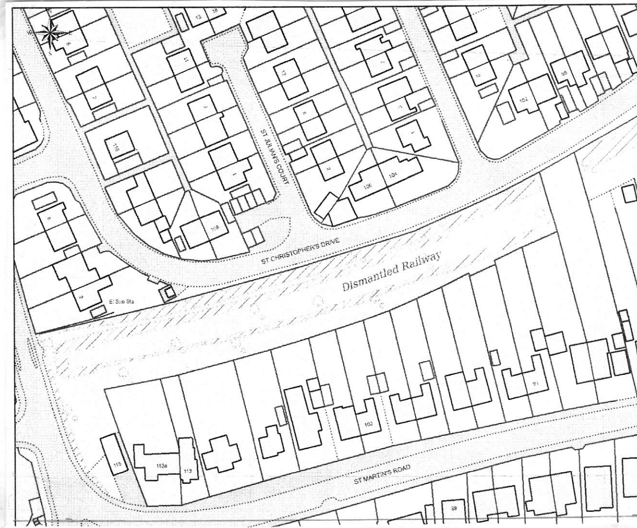
Location Plan - 1:1250