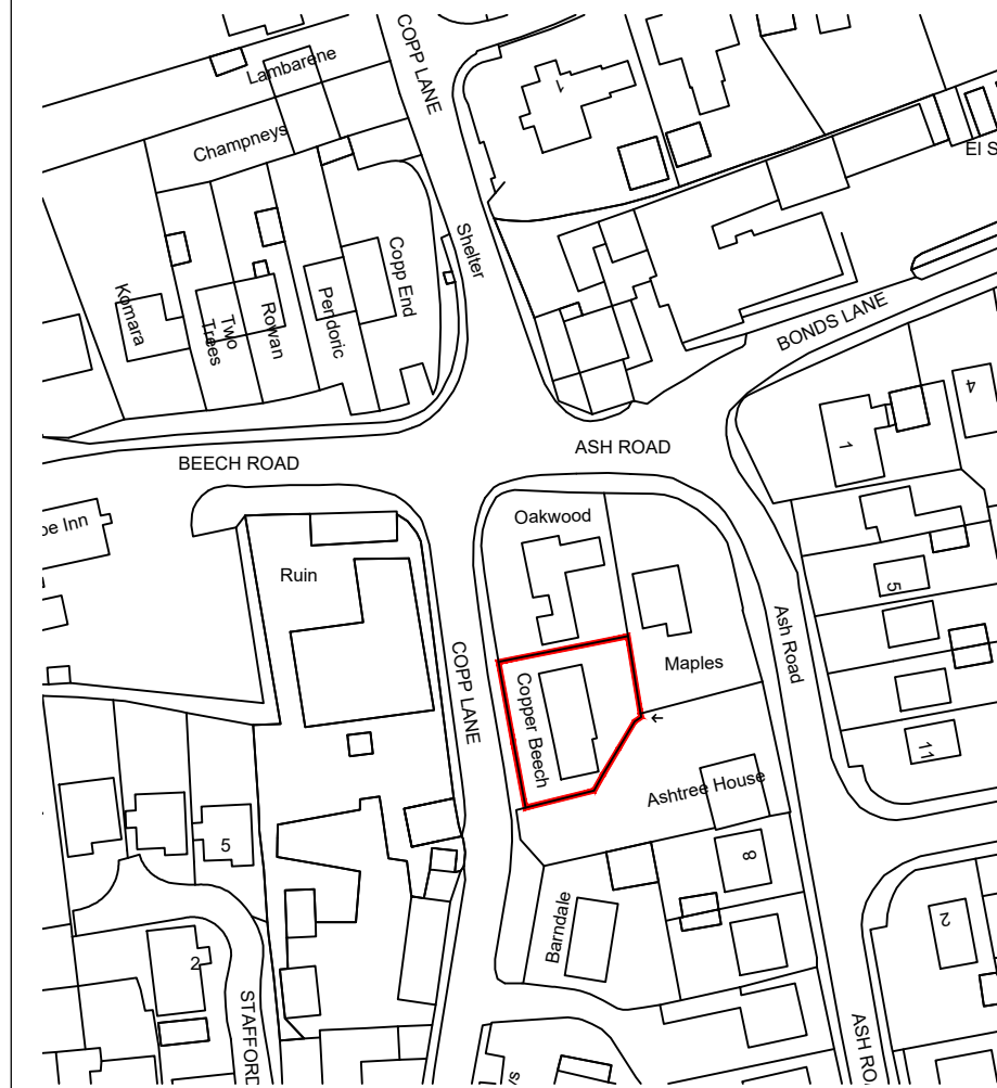
OS LOCATION PLAN (SCALE 1:1250)