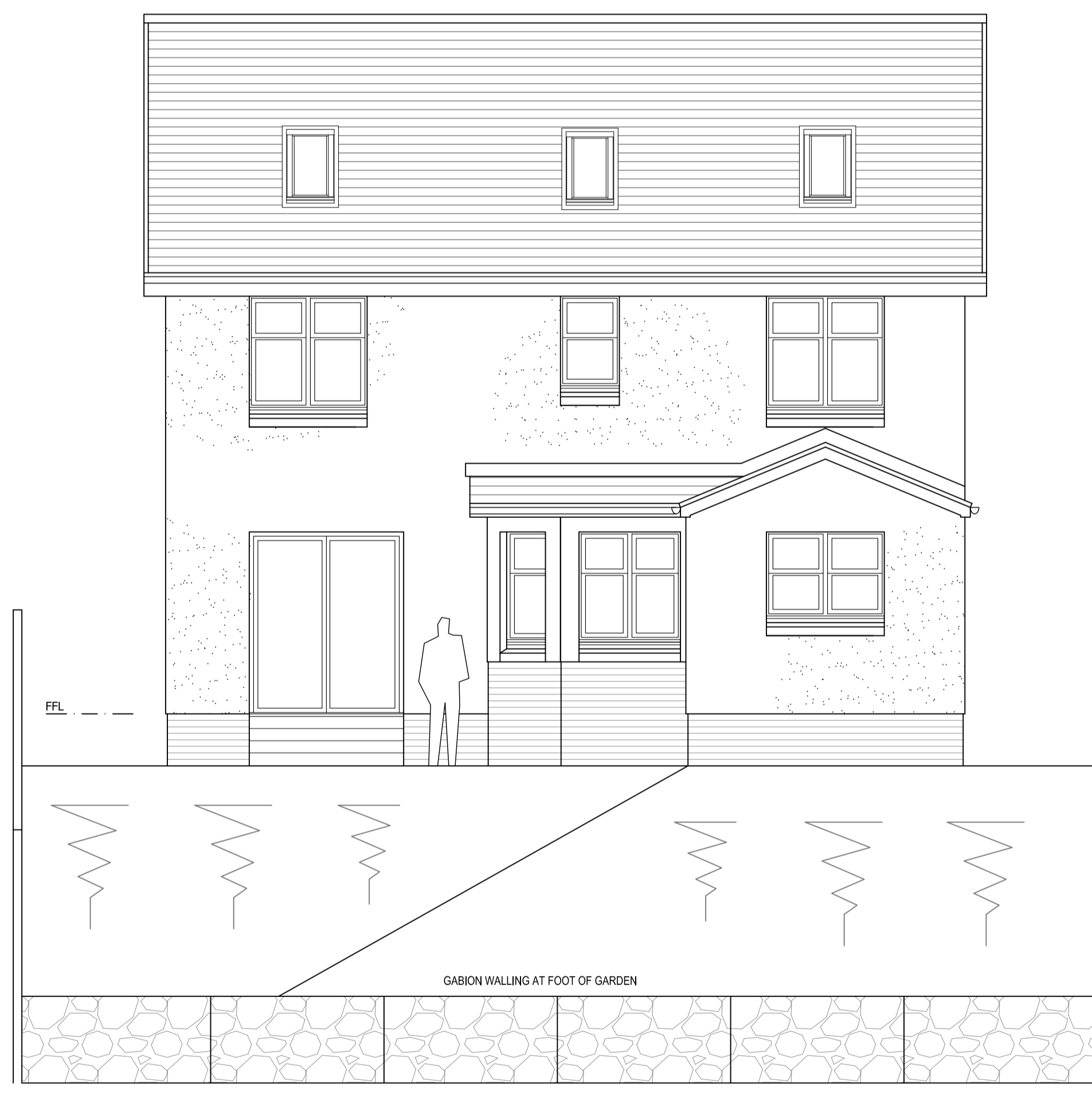
EXISTING WEST FACING REAR ELEVATION