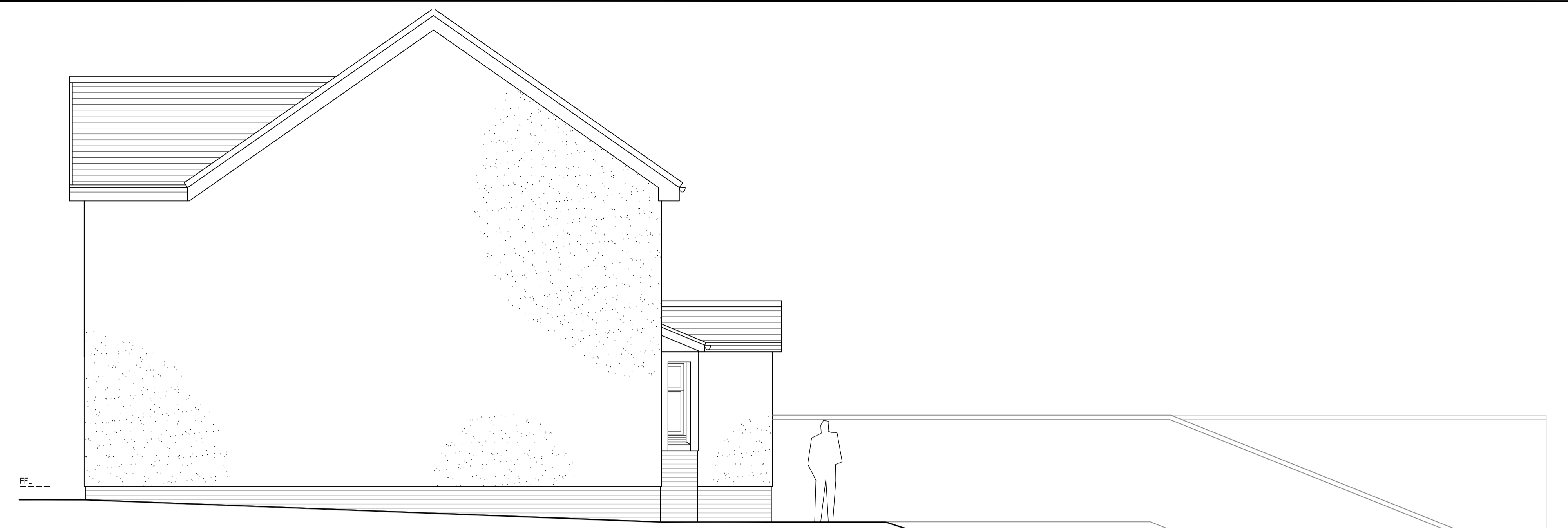
EXISTING NORTH FACING GABLE ELEVATION