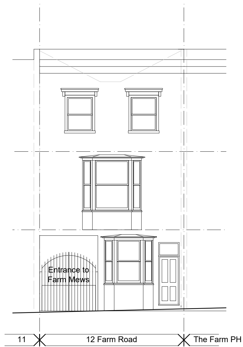
Front (East) Elevation