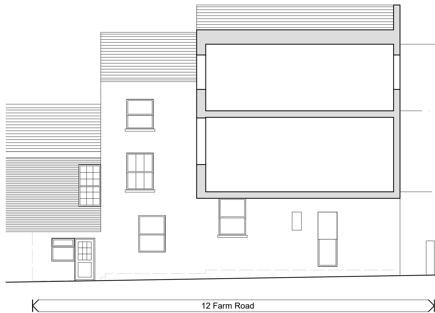
Side (North) Elevation