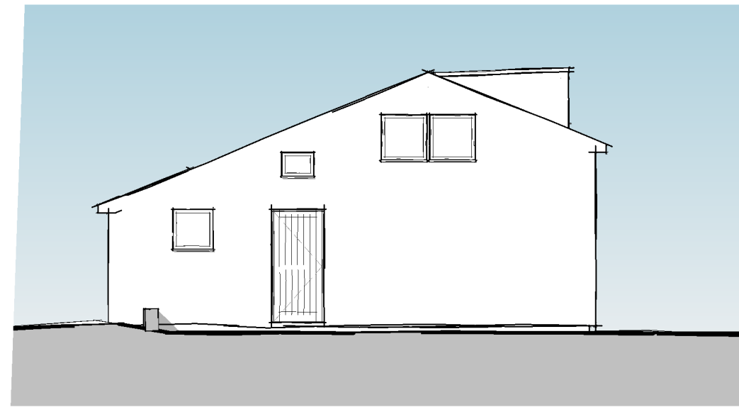
2. Existing Garage - North Elevation scale 1 : 100