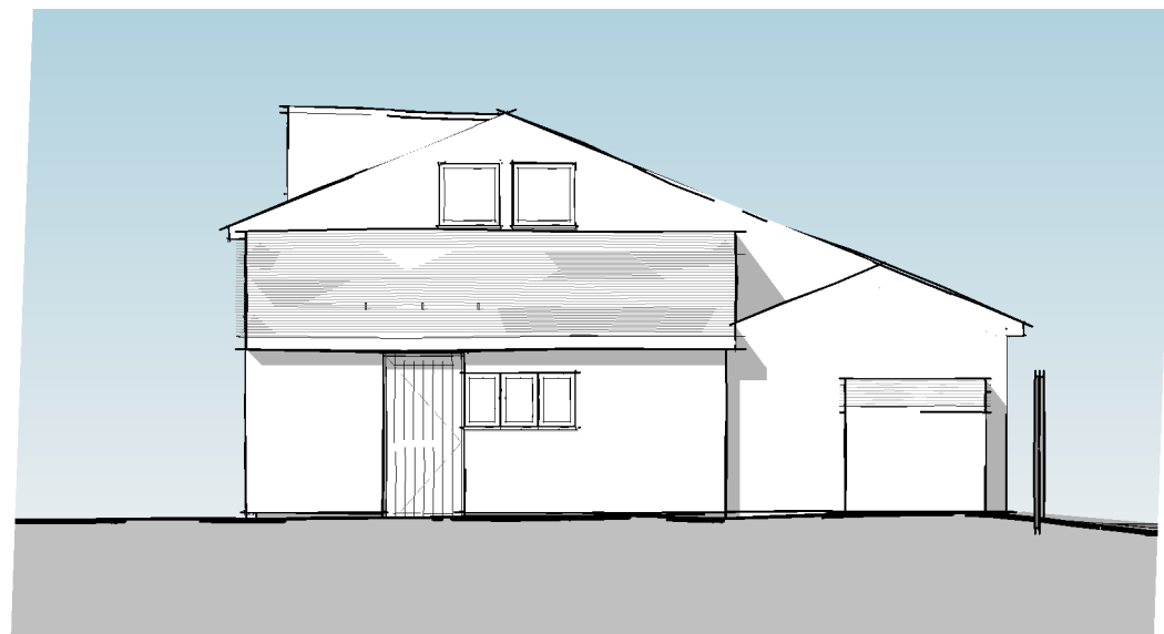
3. Existing Garage - South Elevation scale 1 : 100