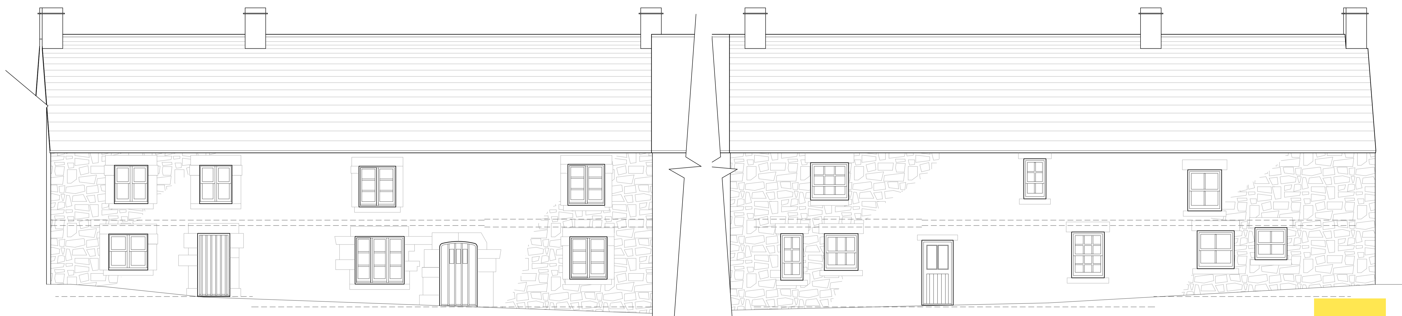
Existing Front Elevation - 1:50