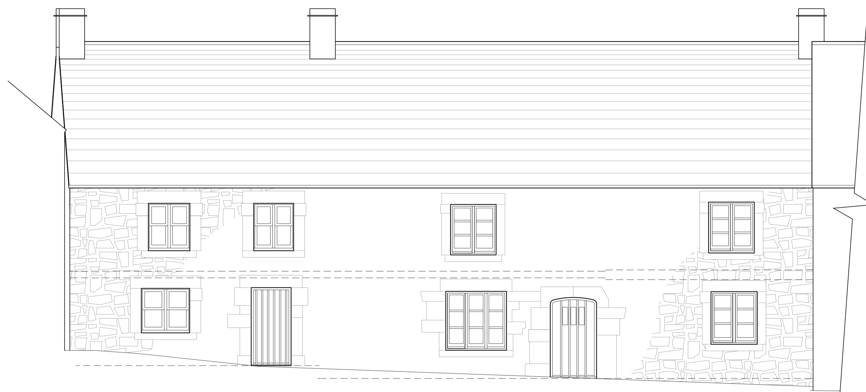
Proposed Front Elevation - 1:50