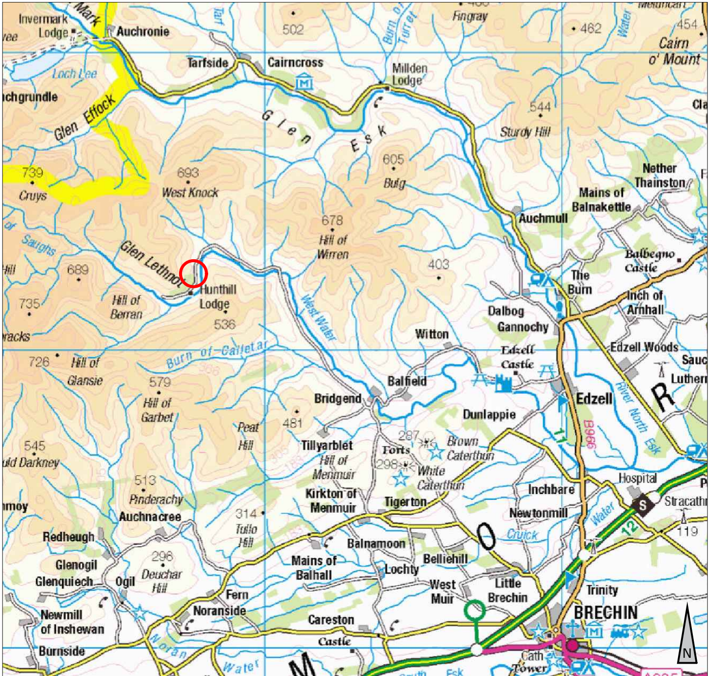
LOCATION PLAN 1:125,000A4

Ordnance Survey (c) Crown Copyright 2020. All rights reserved. Licence number 100022432