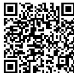
Dining Room Pano