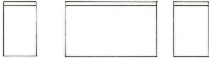
bin store elevations 1:50