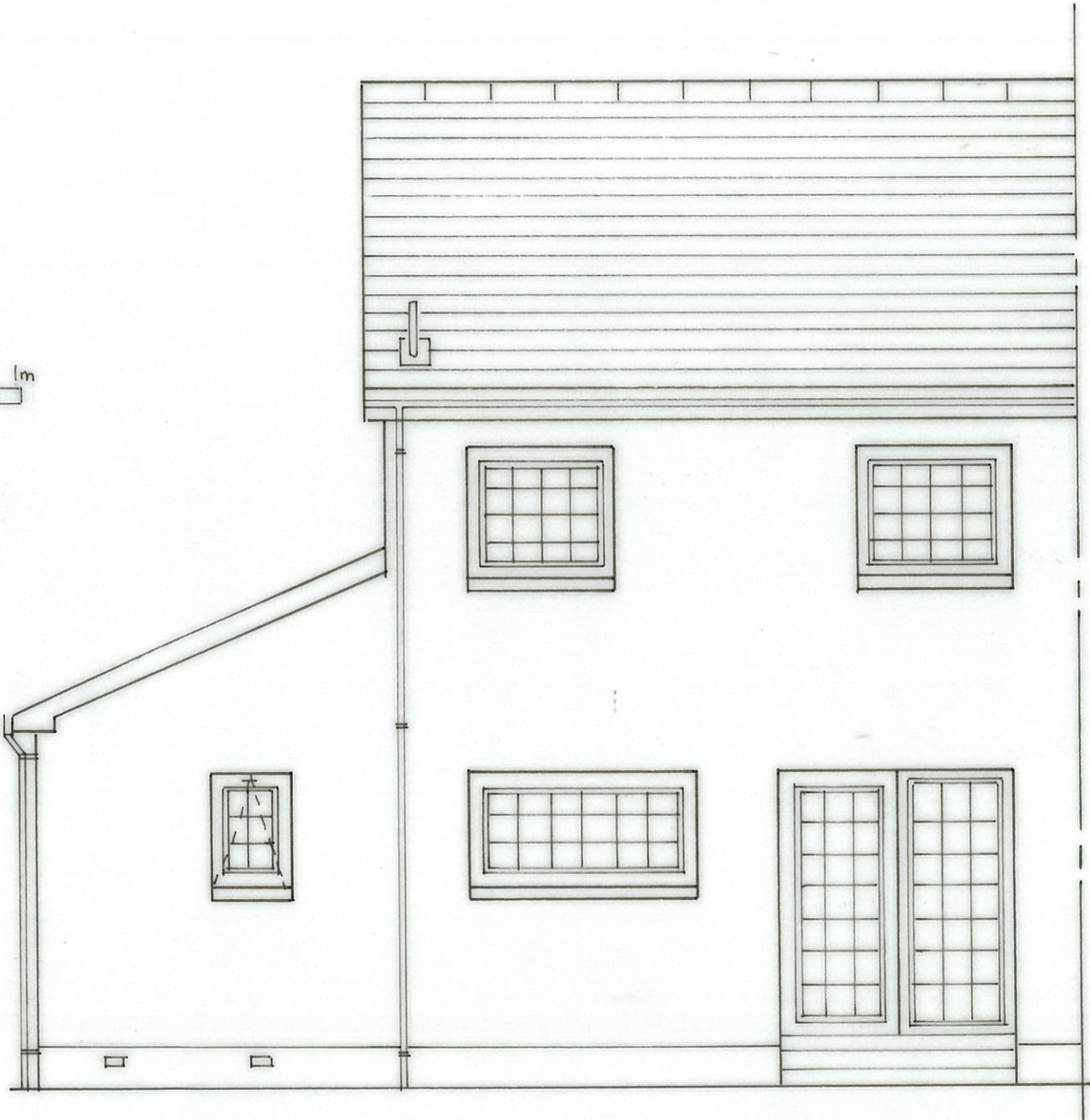
PROPOSED REAR ELEVATION 1:50