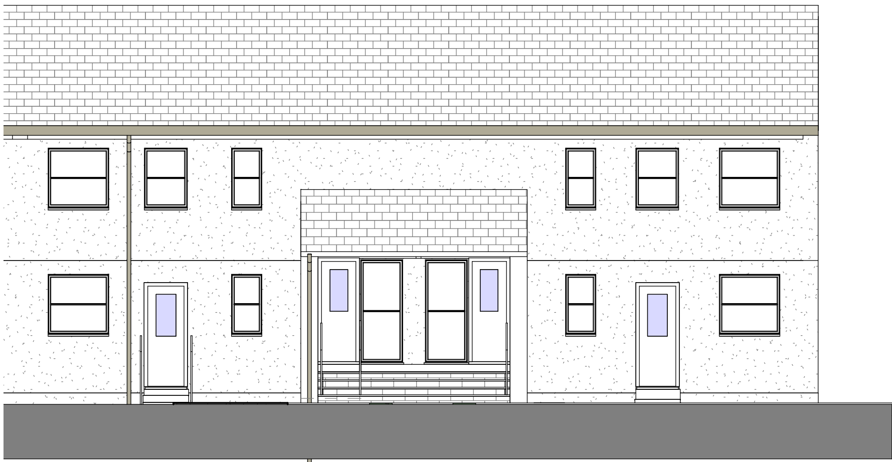
Existing Rear Elevation 1 : 75