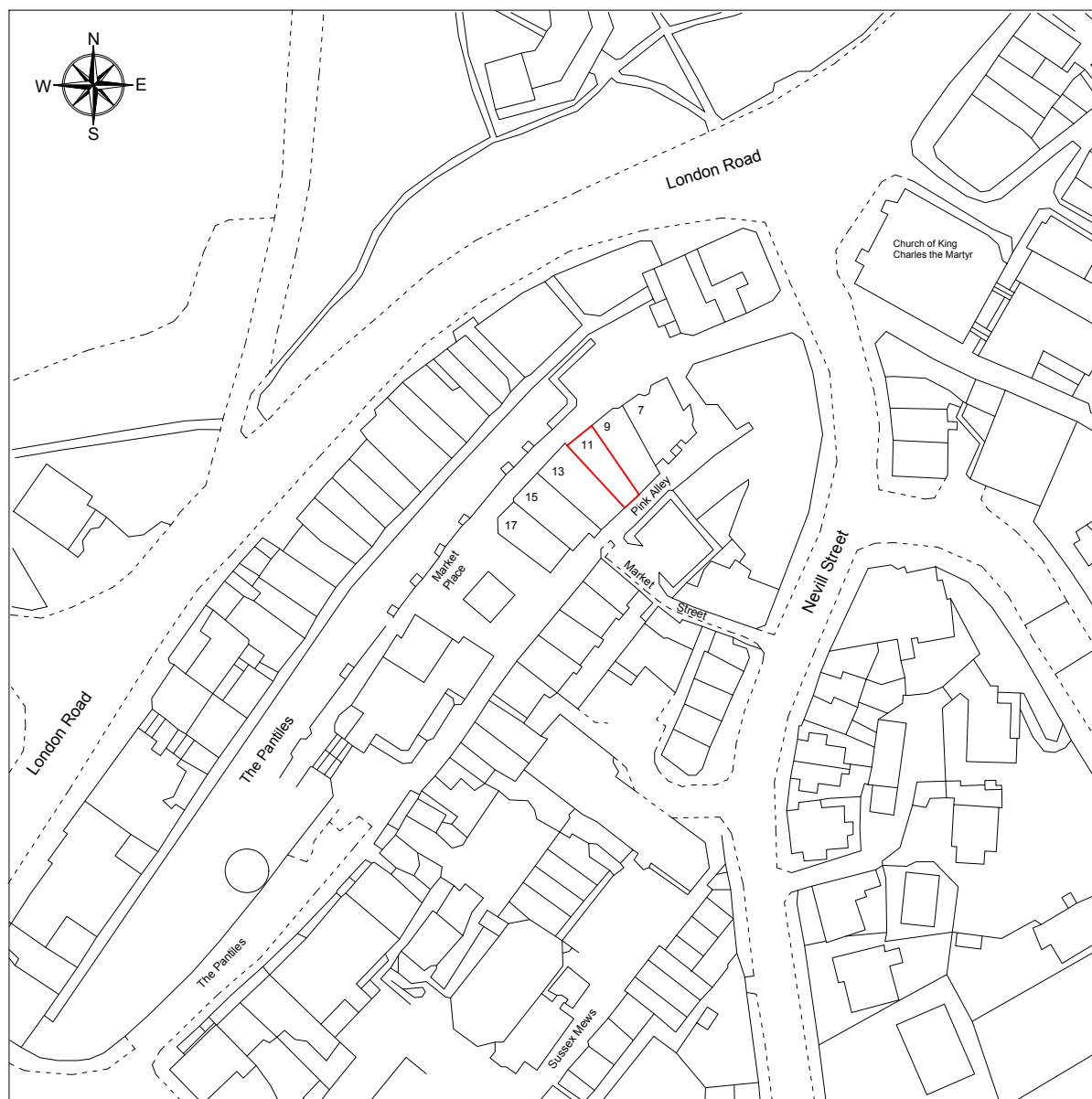
Site location Plan - 1:1250