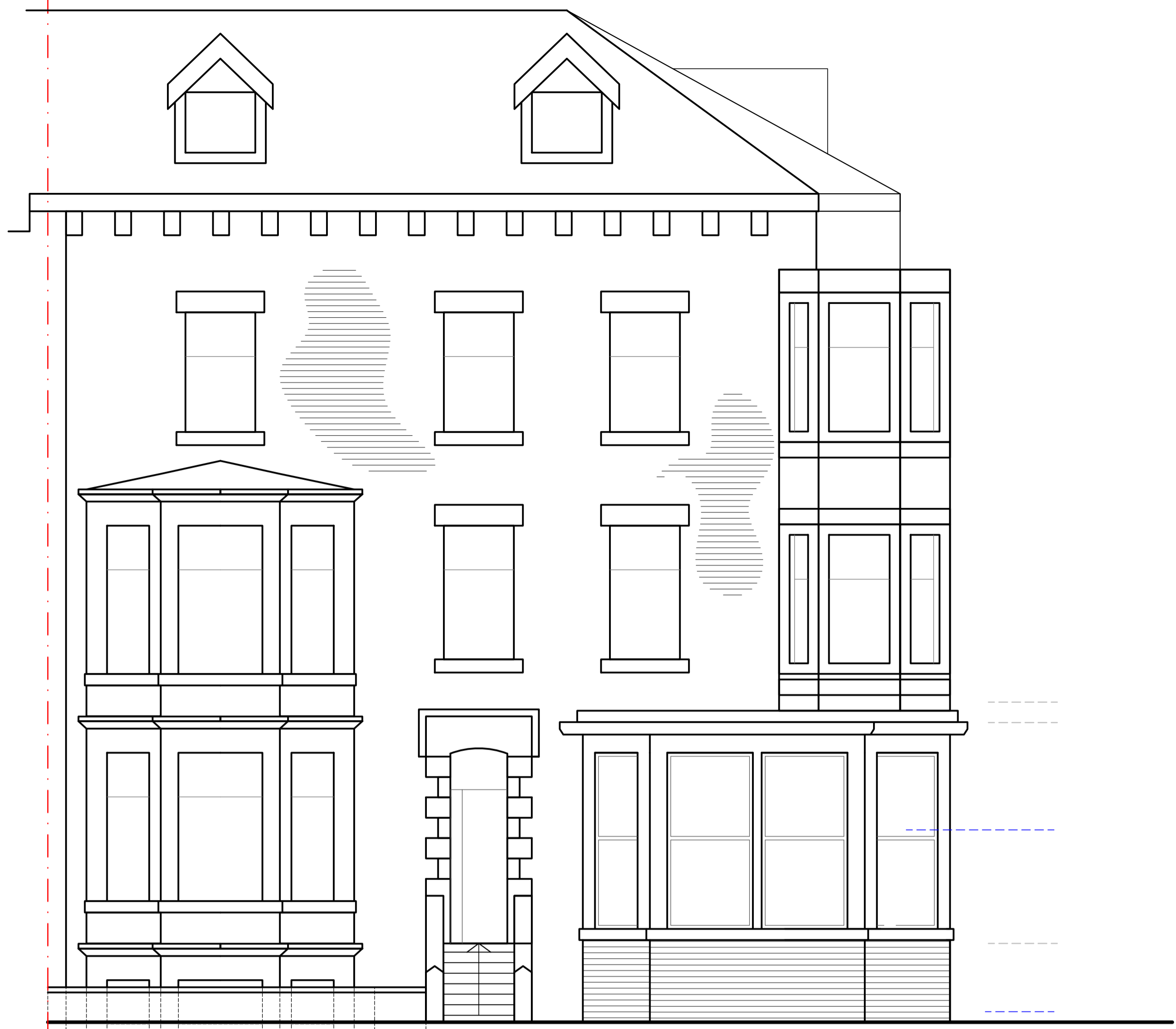
front (view from queen st)