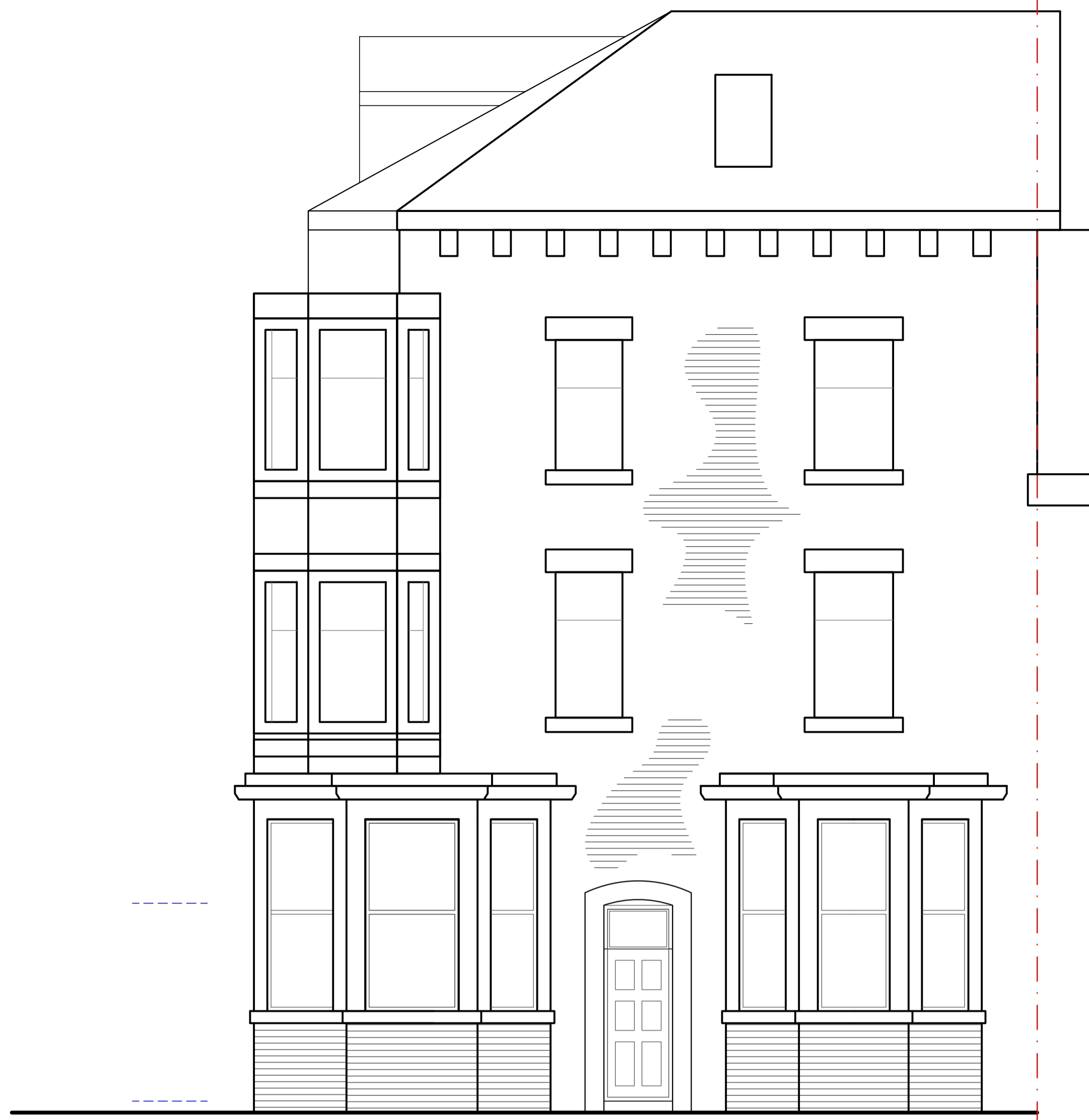
side (view from high st)