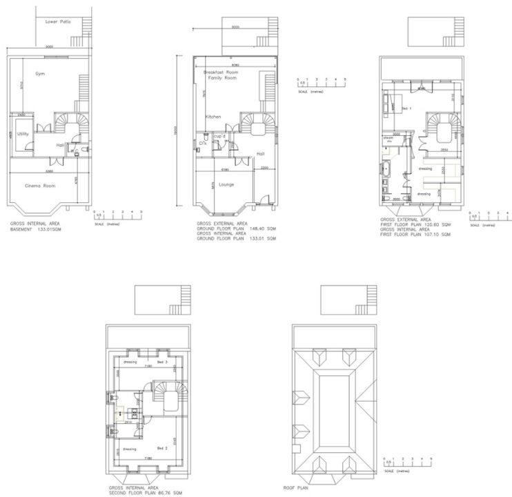
Image 3 Proposed Plans

The proposed house is to be located to the front of the site close to the eastern boundary. The distance to the road will be on average over 15.0 metres as the road curves to the north across the proposed plot frontage.