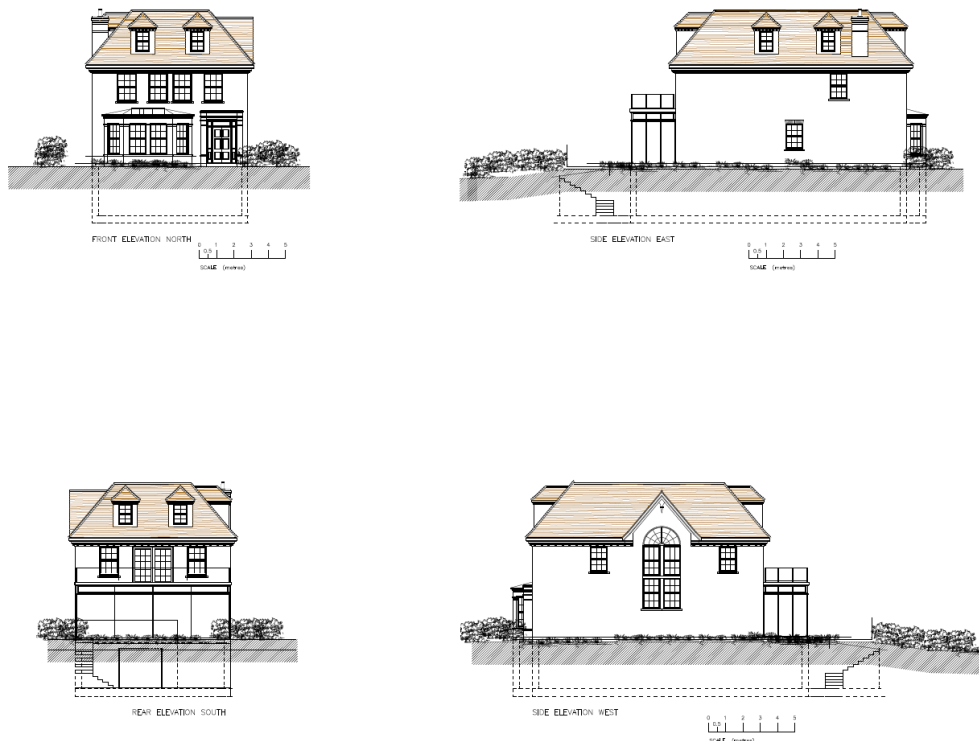
Image 6 Proposed Elevations

The new house has been designed to draw on references from Shoreham House.