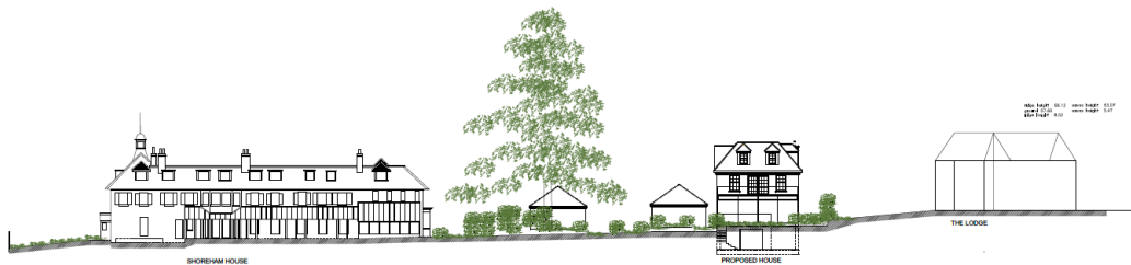
Image 4 Site Cross Section

The proposed house will appear as a two-storey house with accommodation within the roof.