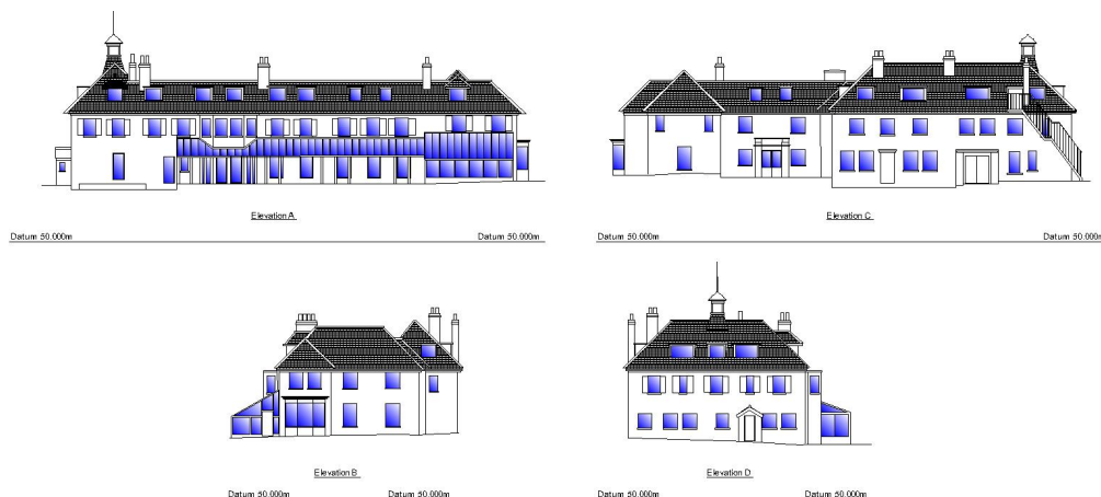
Image 5 Elevations of Shoreham House.

The above illustration shows the distinctive style of Shoreham House.