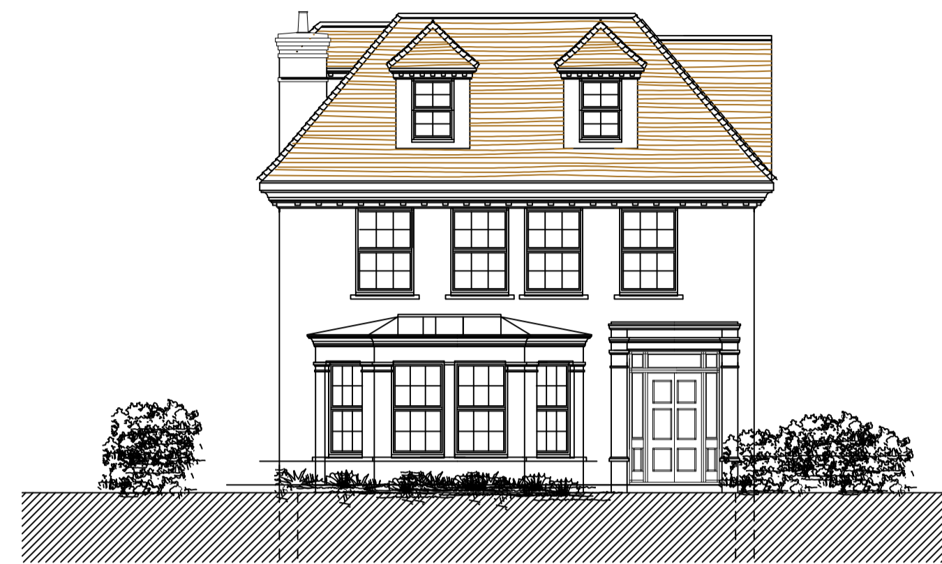
FRONT ELEVATION NORTH