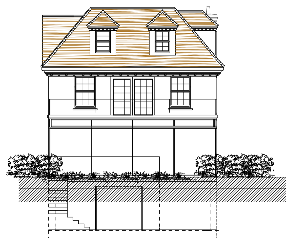
REAR ELEVATION SOUTH