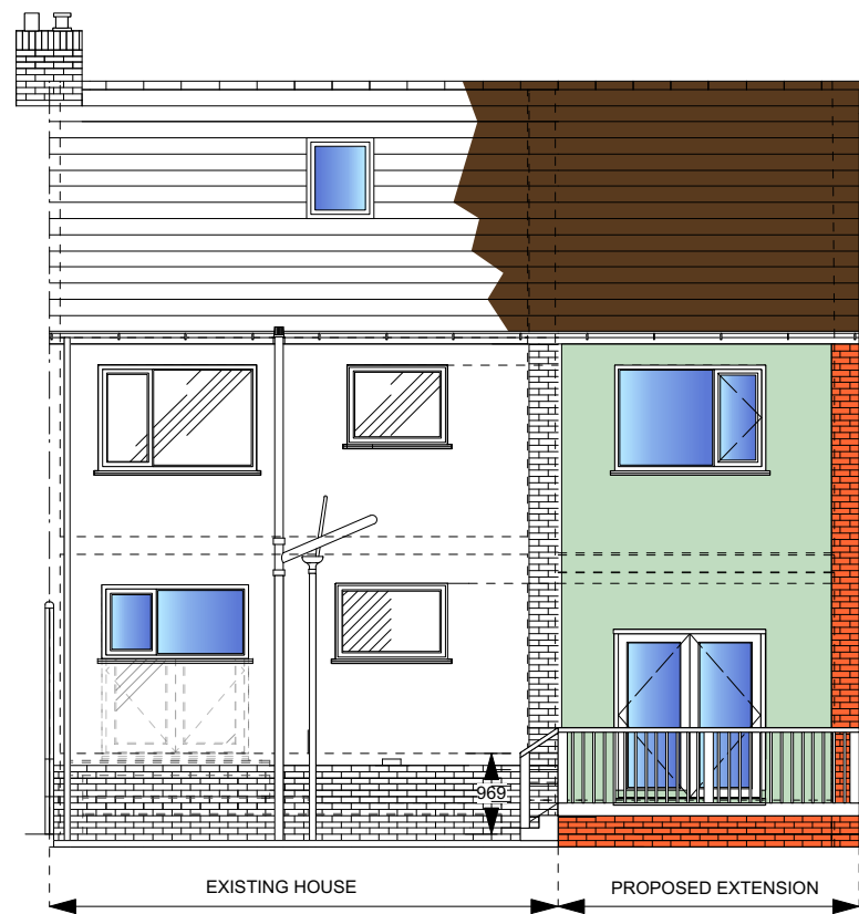
PROPOSED REAR ELEVATION SCALE 1;100