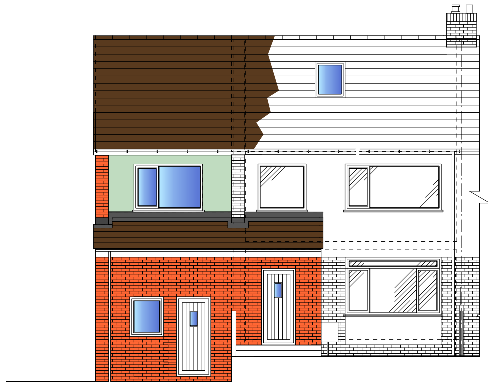
PROPOSED FRONT ELEVATION SCALE 1;100