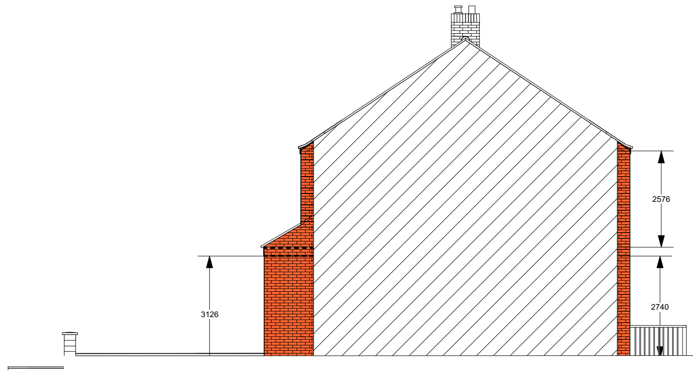
PROPOSED SIDE ELEVATION NO 2 SCALE 1;100