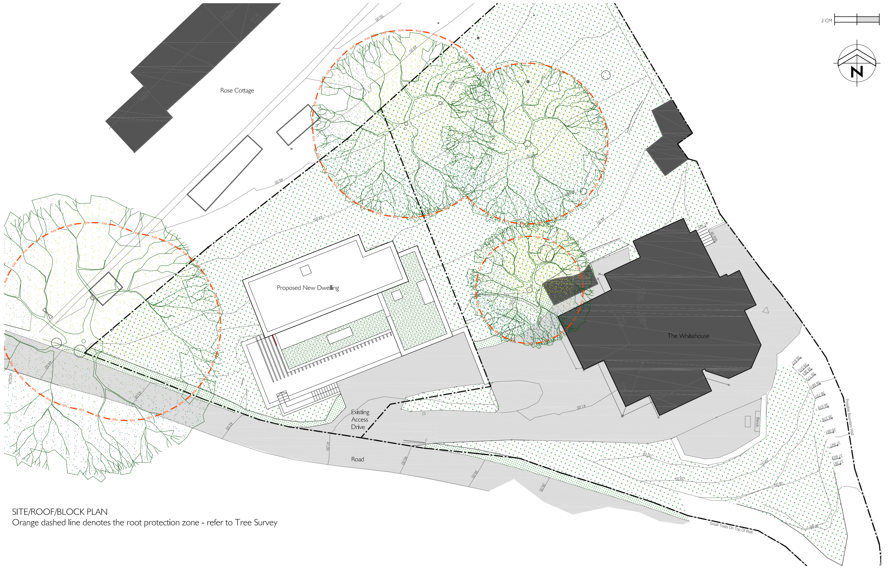
SITE/ROOF/BLOCK PLAN Orange dashed line denotes the root protection zone - refer to Tree Survey

PROJECT LAND AT THE WHITEHOUSE HERODSFOOT PL I 4 4QX