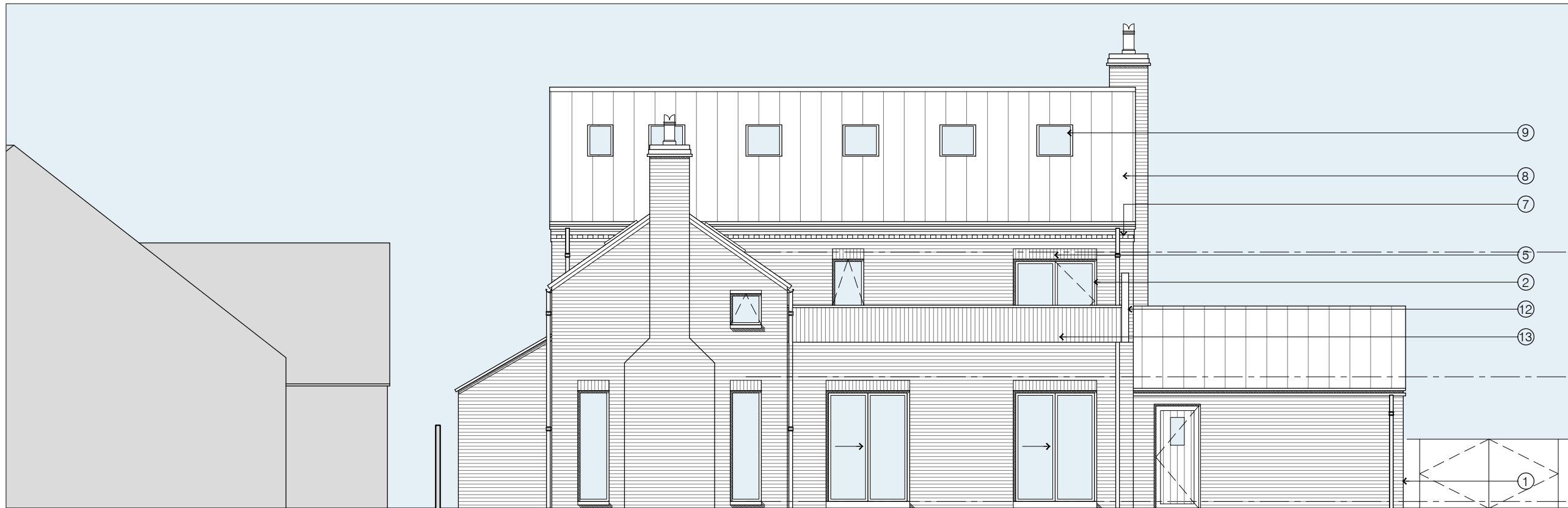
PROPOSED REAR ELEVATION (NORTH-WEST) 1:100 at A3