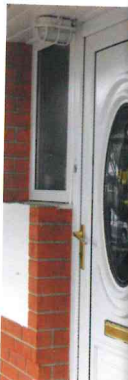
Brick Effect Render