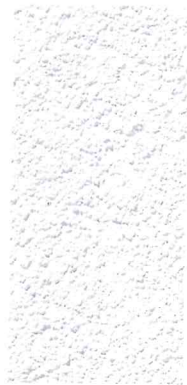
Silicone Enhanced Render

Both EWI and Render systems are available in a range of finishes including silicone enhanced scratch, dash and brick effect renders. Slip systems for clients who require a non-slip finish on a property. It's also possible to finish with cement renders with Johnstone's Trade