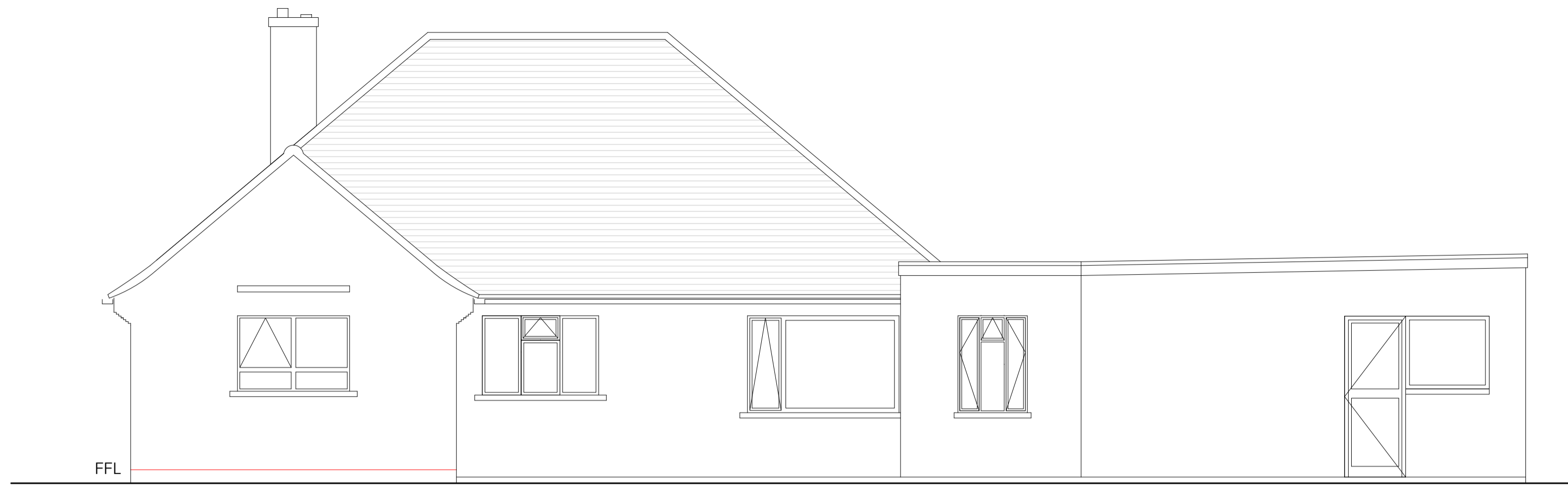
EAST ELEVATION 1:50

DO NOT SCALE. ALL DIMENSIONS TO BE SITE CHECKED ANY DISCREPANCIES TO BE REFERRED TO DESIGNER/STRUCTURAL ENGINEER