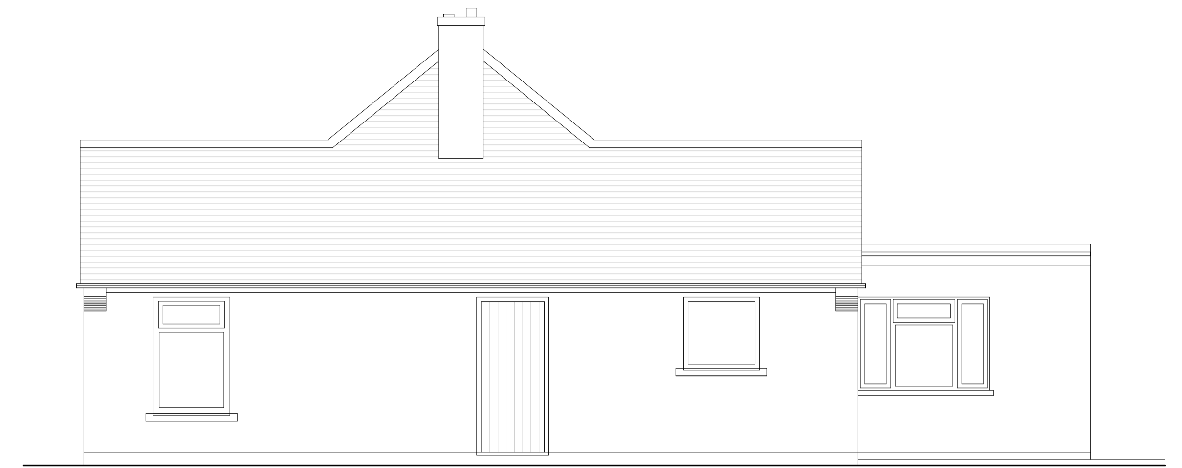
SOUTH ELEVATION 1:50