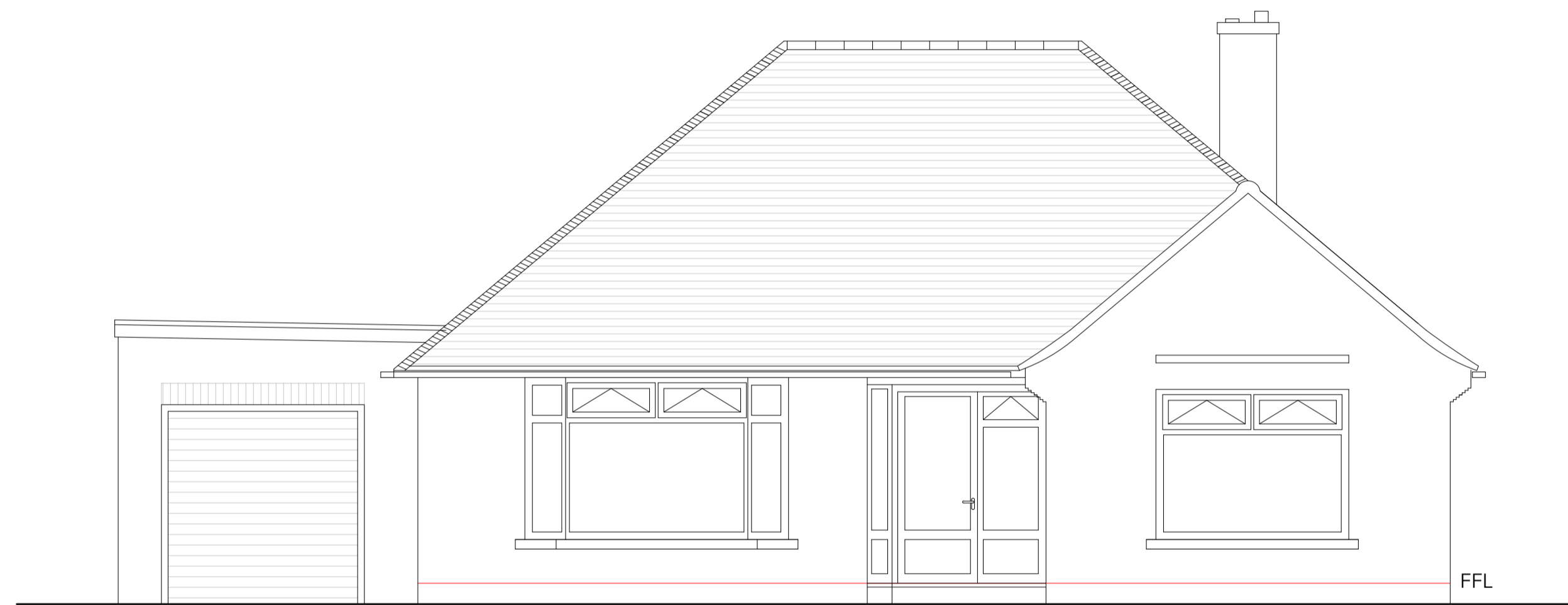
WEST ELEVATION 1:50