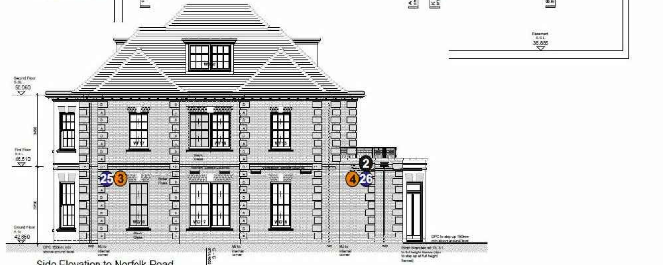
Side Elevation to Norfolk Road