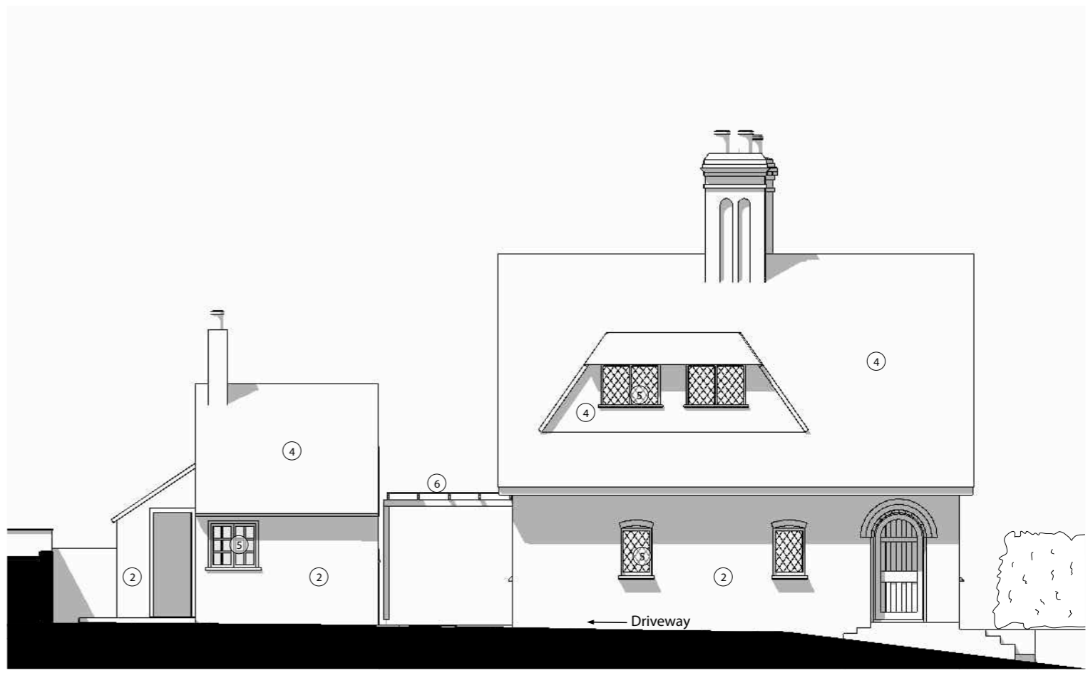
East Elevation (B-B)