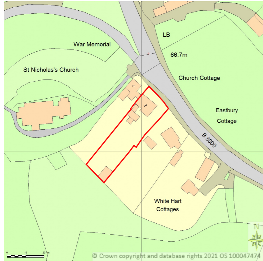
Site Location Plan @ 1:1250