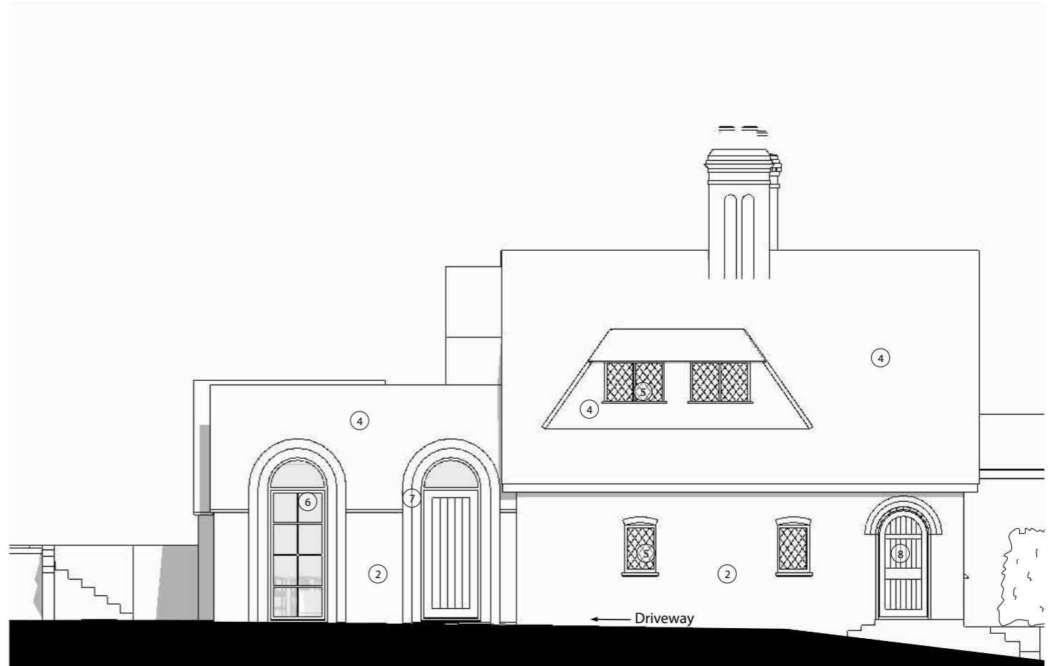
East Elevation (B-B)