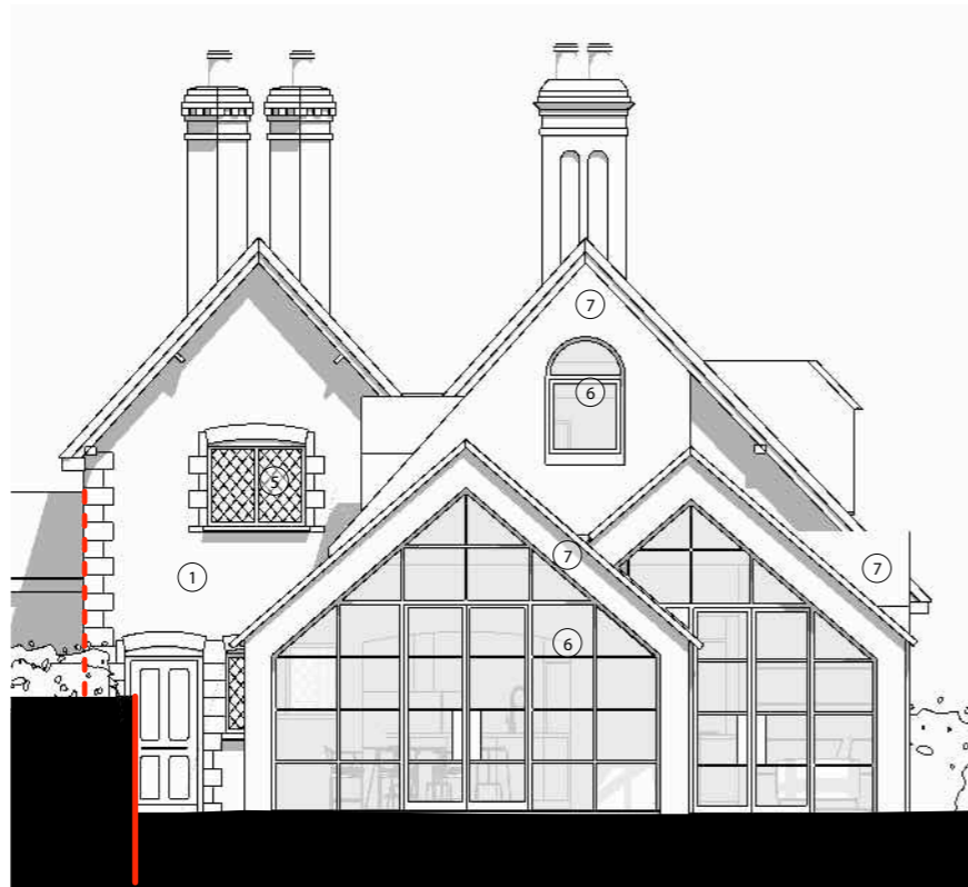
South Elevation (C-C)