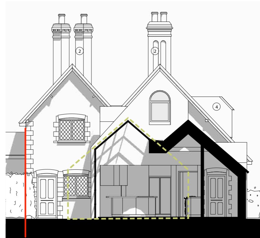
South Elevational section (D-D)