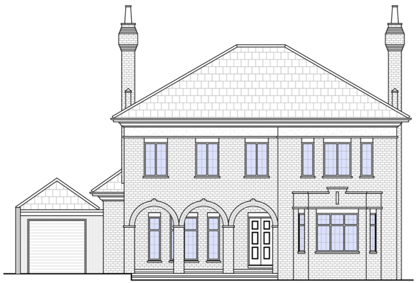
Existing Front Elevation ■