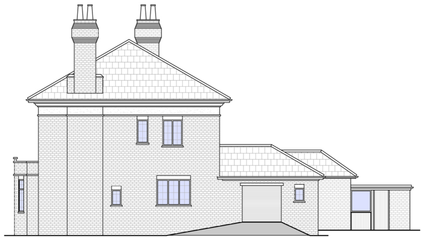
Existing Right Elevation ■