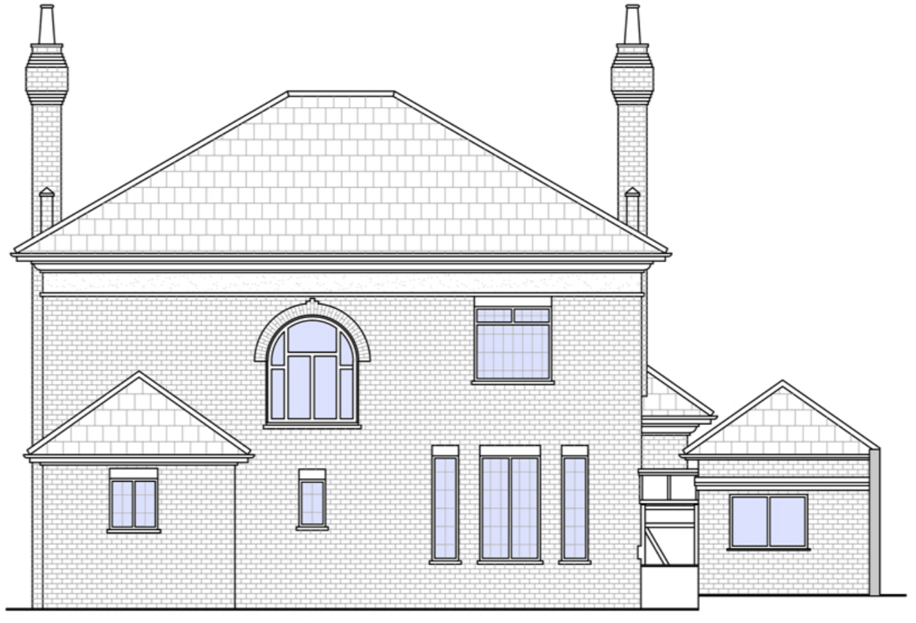
Existing Rear Elevation ■