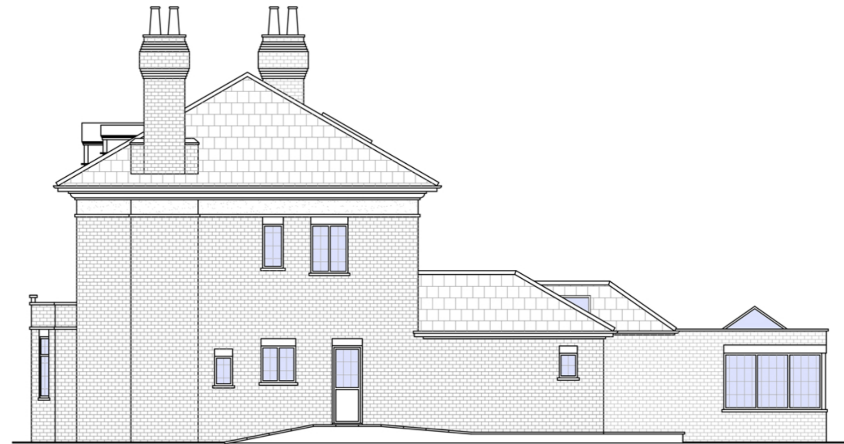
Proposed Right Elevation ■