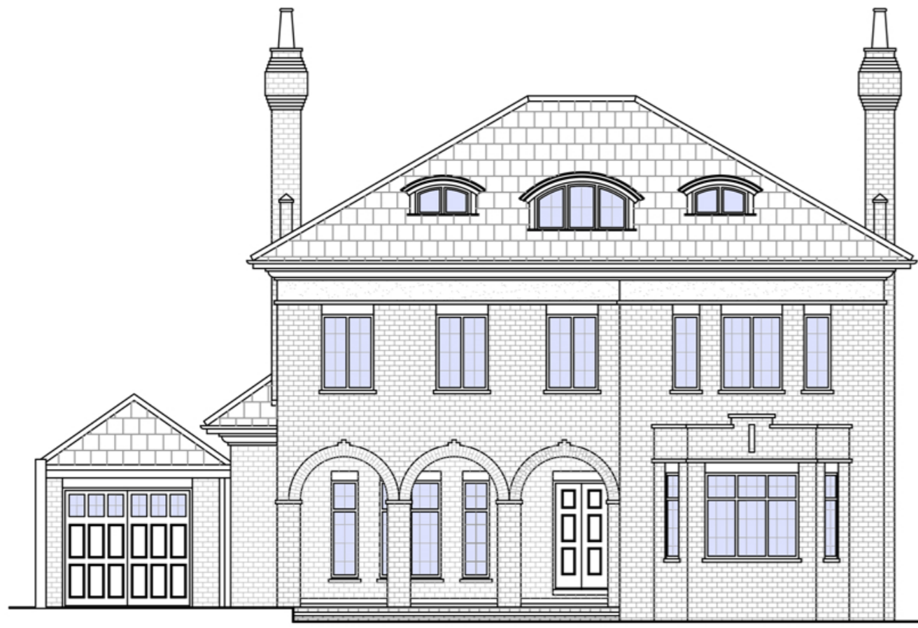
Proposed Front Elevation ■