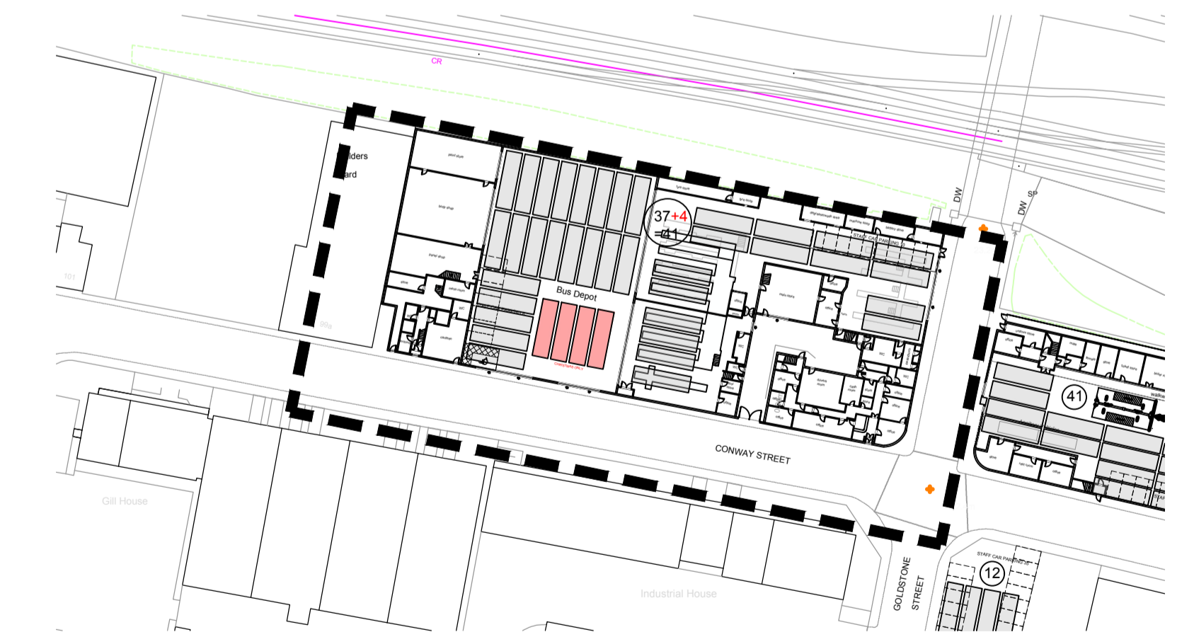
4 1:1000 LOCATION PLAN 200 EXISTING