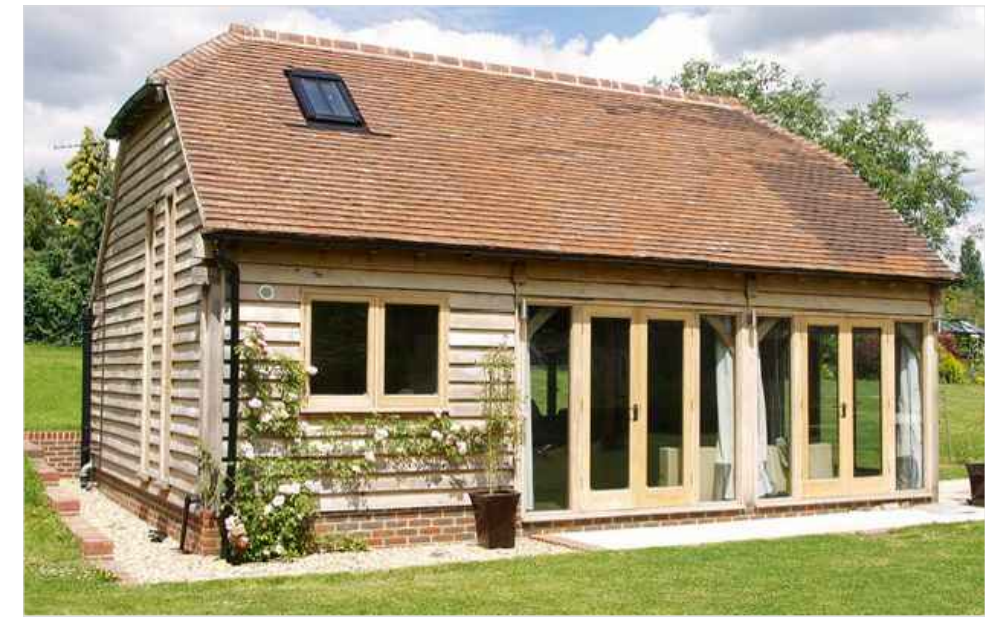
New Holiday Let Building (9.0m x 6.0m)