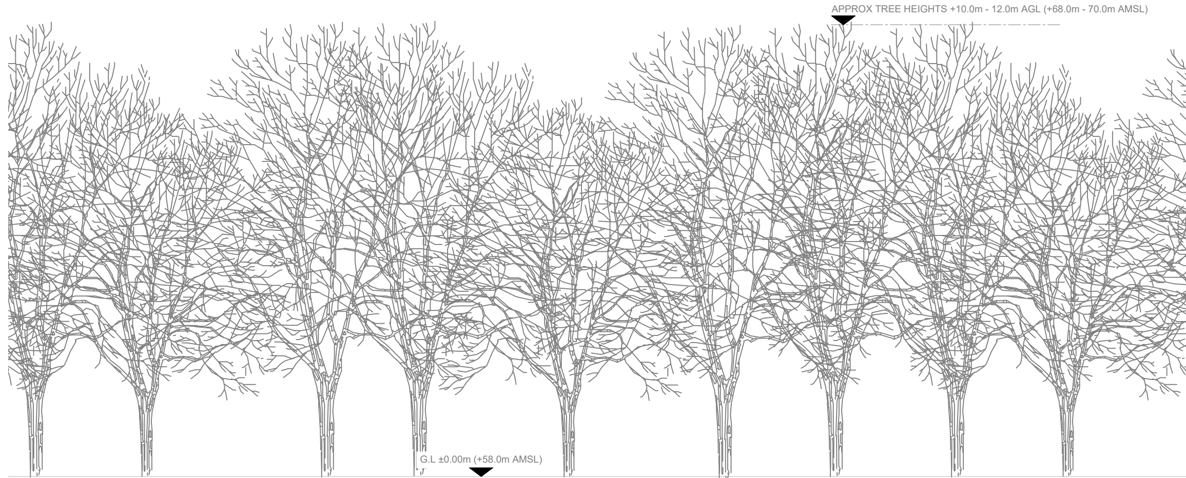
EXISTING ELEVATION A